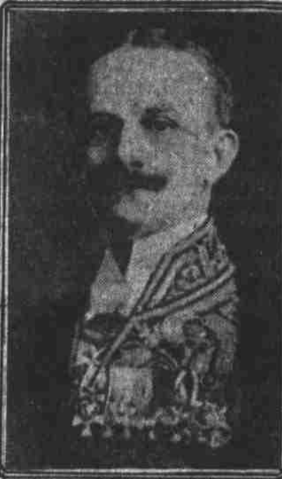
Count Johann Heinrich von Bernstorff, the new German ambassador to America.