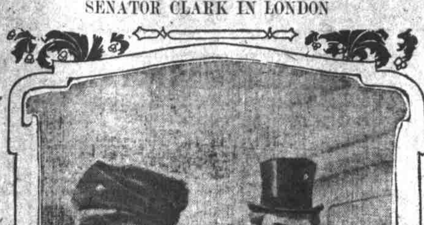
Former Senator William A. Clark and Mrs. Clark. Senator Clark was on crutches in London the result of an injury to his leg, caused by a fall on the Lucania.