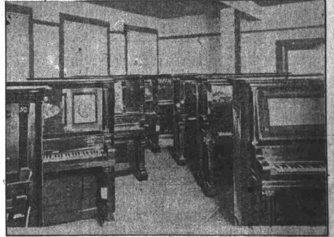
SAMPLE ROOM OF THE GREAT PRICE & TEEPLE PIANOS, CONTAINING FRENCH REPEATING ACTIONS.

KNABE-ANGELUS The Player-Piano That Seems Human