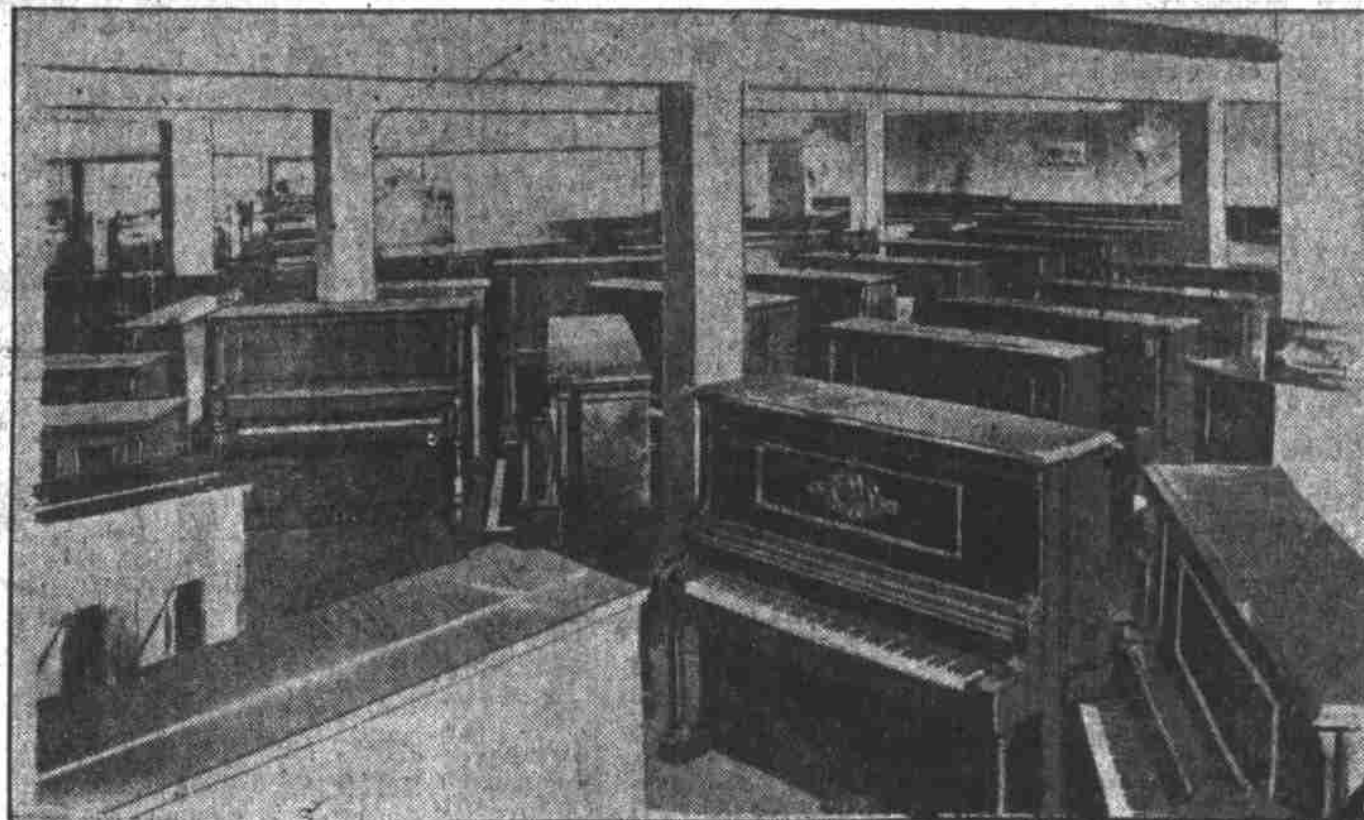
MAIN WAREHOUSE, THIRD FLOOR. Capacity, 200 Pianos.