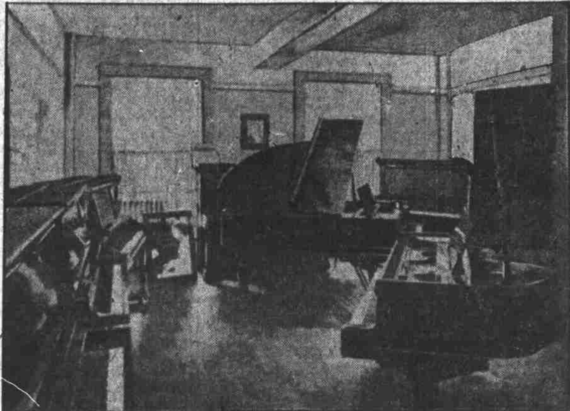
ART ROOM FOR THE WONDERFUL MASON & HAMLIN. Costliest and Most Beautiful Piano in the World.