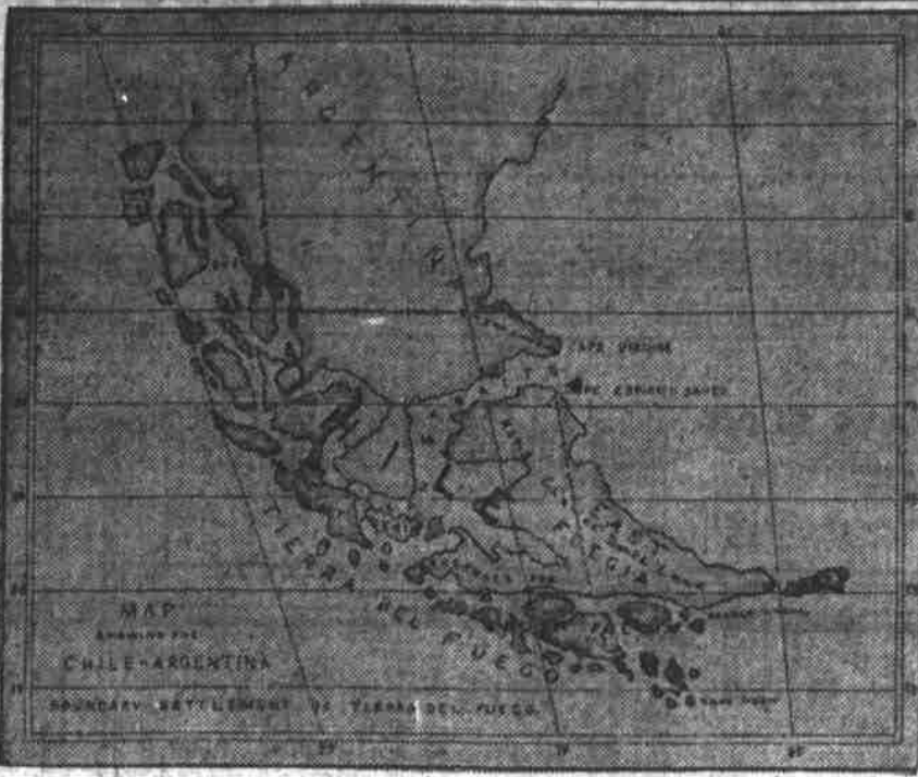
Map Showing Boundary as Defined Between Chile and Argentina.

The chancellor, Plaza, of Argentina and the Chilean minister to Buenos Ayres, Senor Tocornal, have finally agreed on terms of settlement of a long pending question between the two republics, that of the lands lying south of the Straits of Magellan, and known as Terra del Fuego (Land of Fire) consisting of one great island and a numerous outcropping of smaller ones.