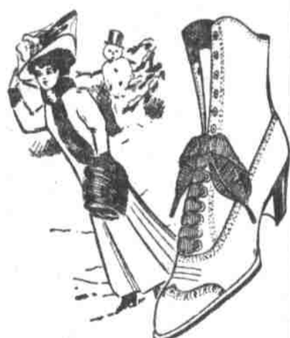
We have plenty of Leggings and Overgaiters.

WOMEN'S SHOES, including broken lines worth up to $2 the pair, and 12 regular lines of $3.50 and $4.00 values; choice of entire lot at, pair ..... $3.19 WOMEN'S SHOES, in odd lines and broken sizes, very good qualities; they are mostly narrow widths (AA to B). We add to this lot 350 pairs of our splendid La Bonte shoes in all sizes; choice of any pair in the lot ..... $1.98 WOMEN'S OXFORDS AND SLIPPERS, including Louis heel and Kimono slippers, odds and ends at ..... HALF PRICE MEN'S BUCKLE ARCADE TICS, $1.75 values, ..... $1.19 MEN'S STORM RUBBERS, special at ..... 75c WOMEN'S FELT JULIETTES, fur trimmed, $1.50 value, ..... 98c