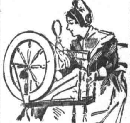
WOOL WAISTINGS—Fine flannels in stripes, plaids, plain or mottled effects; regular 40c and 50c values; special Friday, the ..... 25c

SATIN DAMASK PATTERN TABLE CLOTH with Napkins to match; cloth 2x2, 2x2½, 2x3, 2½x2½ or 2½x3 yards; large assortment, all patterns, ..... $11.00 SATIN TABLE CLOTH in exquisite designs for round tables, sizes 2x2½ and 2x3 yards, at ..... $4.20 TABLE LINEN, extra heavy, full bleached, 2 yards wide, ..... $1.48 FINE SATIN TABLE DAMASK, full bleached, 2 yards wide, worth $1 yard ..... 75c Oregon Flannels at 35c Yard 300 yards of Oregon Flannel, all pure wool; colors gray, brown, navy or black; our regular 50c quality, on sale Friday at, the yard ..... 35c