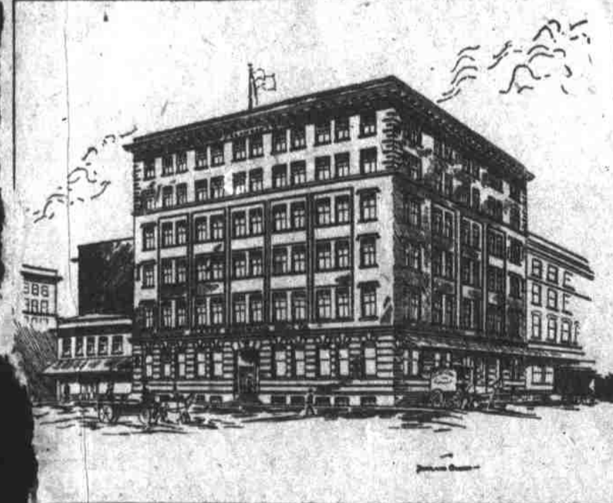
"Cla-wood" Home of the Clarke-Woodward Drug Co.

"Cla-wood" Building, Hoyt and Ninth Streets, Home of Largest Institution of Its Kind in the Pacific Northwest—Manufactures About Seven Hundred Specialties Which Find Their Way to New England States and from Alaska to Mexico—Immense Drug and Drug Sundry Business Built Up Through Efforts of Thorough Drug Men With Business Principles