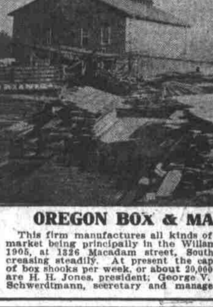
OREGON BOX & MANUFACTURING CO.

This is a condition which will not last much longer. Already the Portland factories are beginning to feel the rapid growth of the demands made upon them.