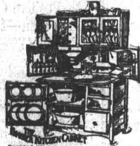
Hoosier Kitchen Cabinet The One That Will Be the Most Helpful and the Most Useful in a Kitchen

It will have her from kitchen drudgery and unnecessary steps—not only this year, but for many years to come. She uses it three times a day—it can't wear out—and it becomes more valuable to her all the time. It is right there in the kitchen—saving just as many steps—just as much labor—each day as it did the day before. Thousands of women have told us that they would rather part with any piece of furniture in the house—before they would do without their Hoosier Cabinet. That is why a Hoosier Cabinet is the finest Christmas gift—the one that will be appreciated the most. It groups every article—all utensils in one place.