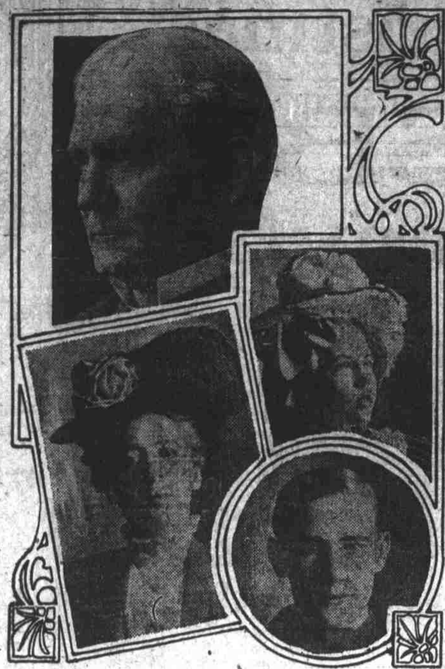
Champ Clark, the leader of the minority in the house of representatives, his wife, son and daughter.