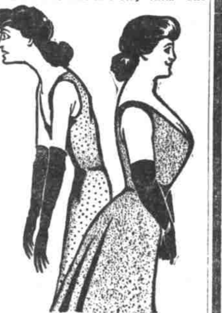
Protons, the Remarkable Tissue Builder, Builds Up Cases Like This in Remarkably Quick Time.

A remarkable, scientific treatment has been found which increases the weight of scrawny or thin people, puts flesh on those who have been thin for years, whether from disease or from natural tendency; on those who by heavy eating, dieting or other means, are in vain tried to get fat; on those who feel well but can't get fat, and on those who don't feel well and stay thin. The