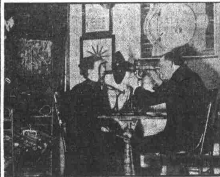
OPTICAL ROOM OF STAPLES THE JEWELER. Although small, it is completely equipped with all the latest mechanical contrivances for measuring eyesight.