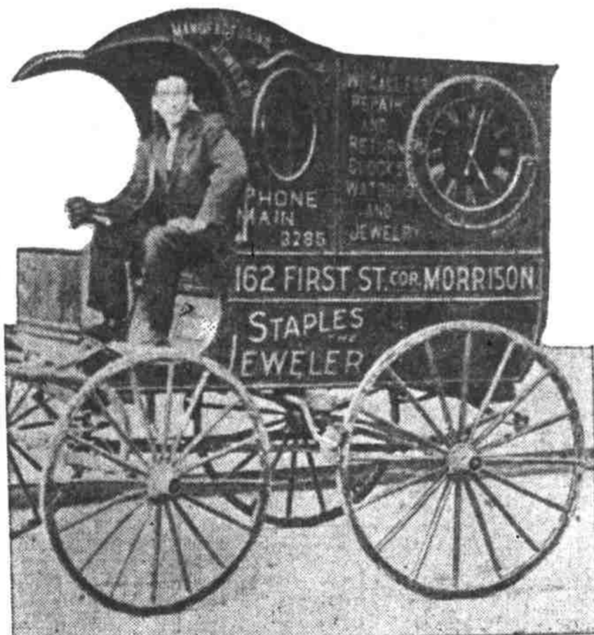
This wagon will call for and return to you anything you have for repair in our line. PHONE MAIN 3285.