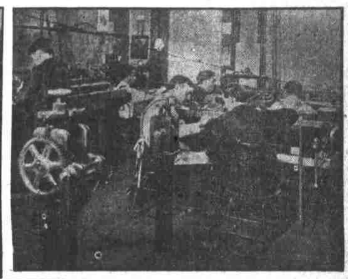
JEWELRY REPAIR SHOP OF STAPLES THE JEWELER. We give constant employment to five and sometimes six jewelers in our jewelry repair shops. We make anything and everything in the jewelry line.