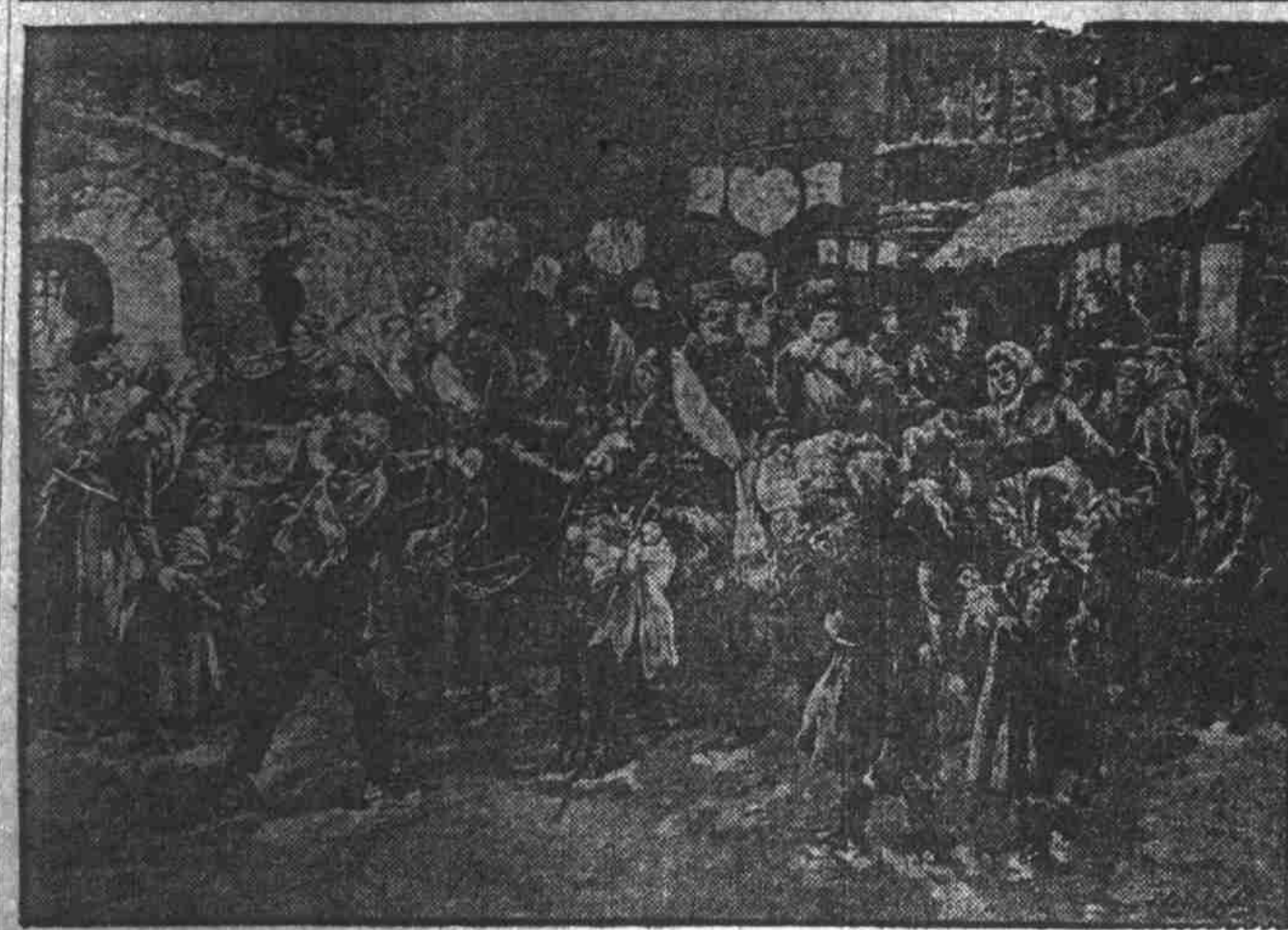
Students in the University at Bern, Switzerland, Celebrating Christmas.

The celebration of Christmas in the university at Bern takes place on St. Nicholas day. On this day the students, dressed in fantastic costumes and mounted on mules, carry gifts to the poor districts of the city for the children. The occasion is always one of hilarity and is accompanied by the tooting horns and much singing.