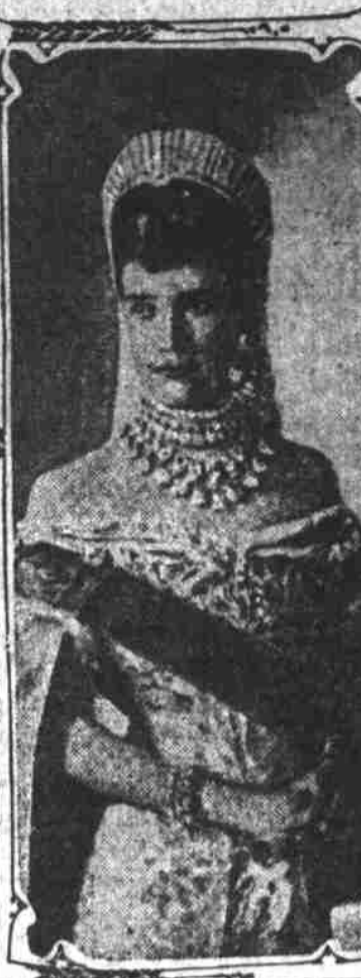
The dowager empress of Russia, a plot against whose life was recently discovered.

In these there is a lack of uniformity and a conflict of judicial interpretation. There are many cases where a stream has its source in one state and its waters are used for irrigation and power purposes in another; the latter state has no power or authority, if the necessity should arise, to go into the former and construct storage reservoirs, no matter how valuable they might be.