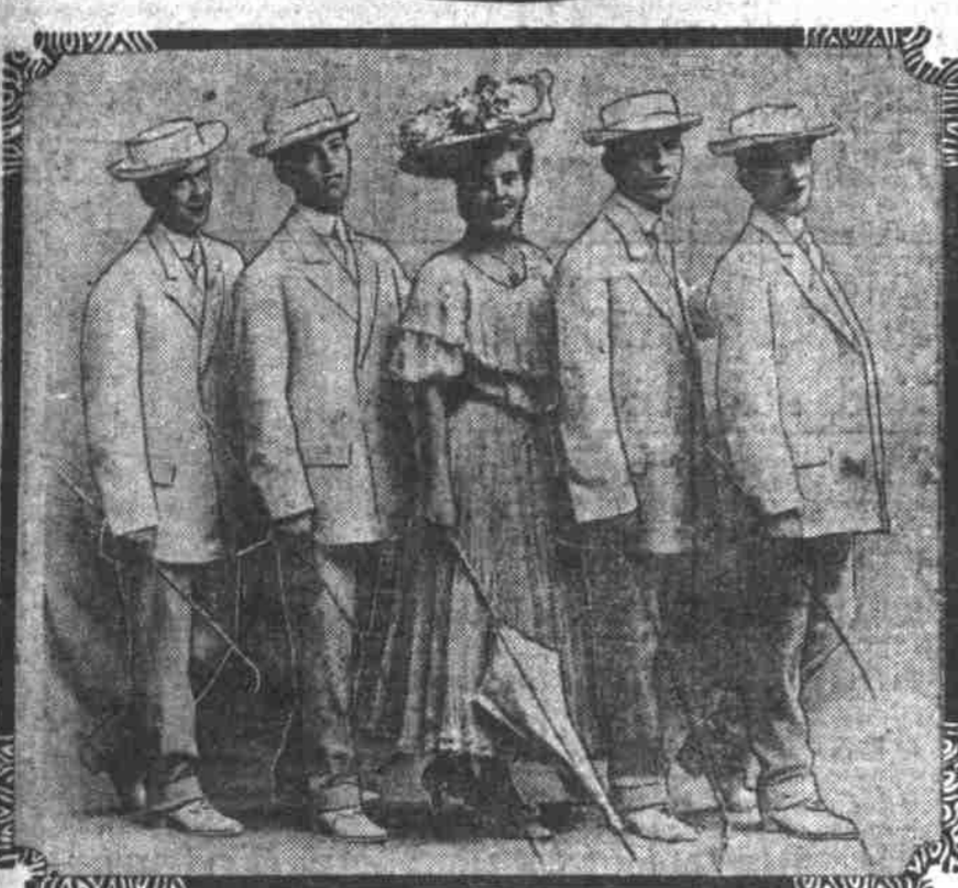
ROYAL MUSICAL FIVE AT THE GRAND