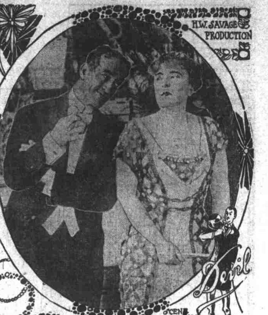
THE DEVIL AT THE HELDIG, DEC. 14 & 15