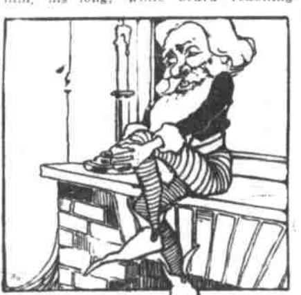
"PERCHED UPON THE MANTEL"

Ella was joyfully shaking her head yes, when suddenly a voice interrupted: "There's really no great need to go so far, inasmuch as the Wizard of Games is here before you."