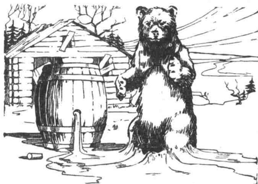
THE BEAR HAD ROLLED OUT A BARREL OF MOLASSES