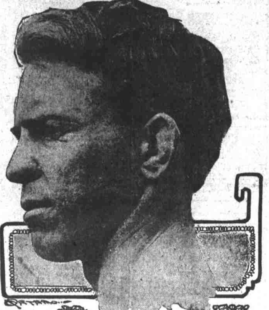
Wonderful human fighting machine who has told aspiring lightweights that they must fight it out among themselves before they can go into the ring with him. This is the latest and best photograph of the pugilist-capitalist-literateur.