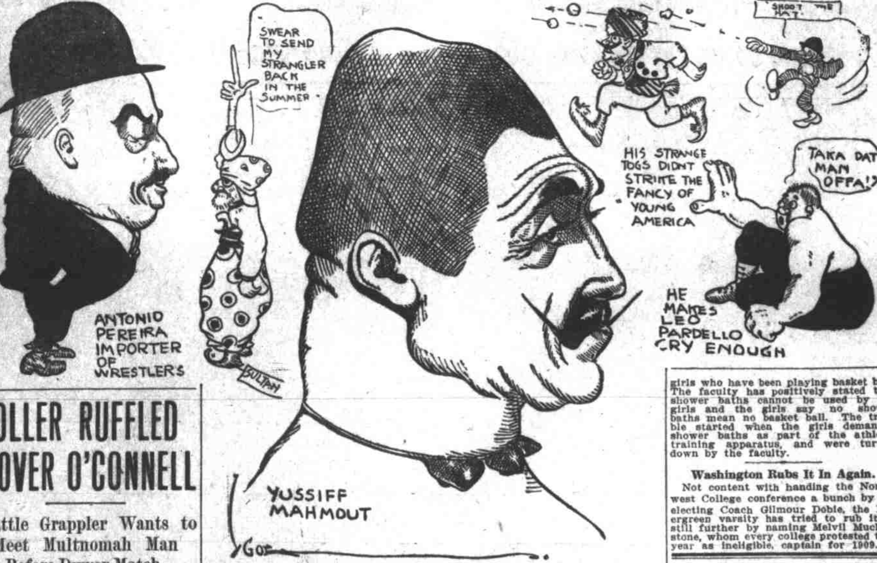
Sultan's invader, who easily threw Tom Jenkins and who may be matched to meet Champion Frank Gotch for a $10,000 Purse.