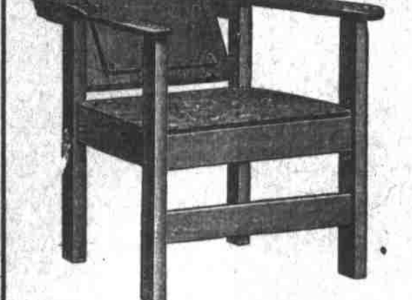
$2.75 Value for $1.25 Child's Morris Rocker

You Are Welcome to Credit By making large purchases we are able to offer for the Holiday Season a few Specials for children's use that are within reach of any purse. Our other lines are now complete and it is our aim that prices shall always be reasonable here. Please notice the special offerings this week