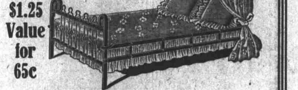
$1.25 Value for 65c Brass Finished Doll Bed

Of these we have a grand selection and the wise buyers are already on the move to pick out the best. If you wait until December 24 at 9 p. m. you will have to take the leavings. Buy—and do it now.