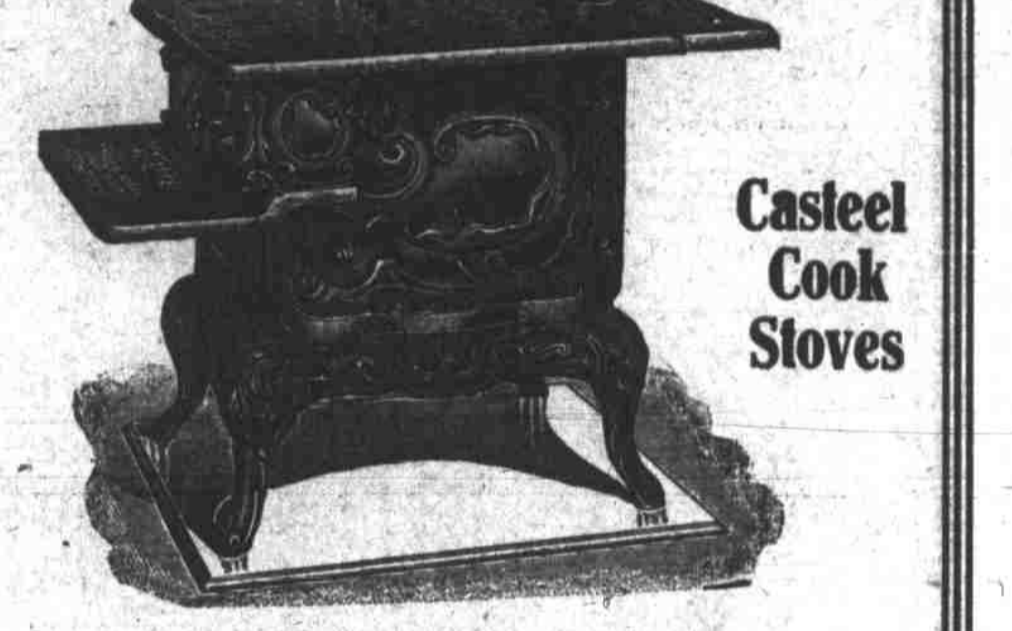
Casteel Cook Stoves

Two hundred mothers have already taken advantage of this opportunity of making 200 little ones happy at a trifling expense. We have only 200 more, and Christmas buying has hardly started. Read the description: Complete doll bed with mattress, pillows and canopy of flowered cretonne, size 18 inches long, 11 inches wide, 15 inches high; constructed of unbreakable brass finished steel rods, exactly like the illustration; can be folded perfectly flat; price only 65c