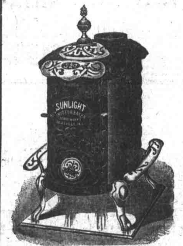
$10.50 Sunlight Heaters, $8.50

For children, but not so small as the price would suggest. Notice the size; desk is 28 inches high; top, 22 in. by 17 in., can be raised, showing compartment for books underneath; desk and chair are both oak and can be furnished in golden or weathered finish; price of both only $2.95