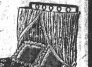
A Snap 65c

Child's Iron Crib $6.75 White enamel iron child's crib, drop side, woven wire spring included; size 24x50 inches ..... $6.75 No. 102—Enamel iron crib, reversible sliding sides, brass rail and knobs, steel spring, regular $12.75, reduced to ..... $9.75 No. 163—Best in town for the money, vermicular iron finish, reduced from $9.00 to ..... $7.00