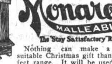
Monarch Malleable Range

Eight-day Clocks, which strike every hour, guaranteed to be perfect timekeepers, mounted in golden oak frames ..... $2.75 Regulator Clocks, for hotels or restaurants ..... $5.40 Fine parlor Clocks, as shown in illustration, all the latest improvements and guaranteed timekeepers, with beautiful enameled marbled cases, only ..... $6.25