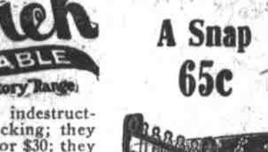
A Snap 65c

Brass Doll Beds 65c $1.75 value, exactly like illustration, 15 inches long, 11 inches wide and 15 inches high, made of bent brass rod, complete with canopy pillows and mattress, all covered in flowered cretonne, only ..... 65c