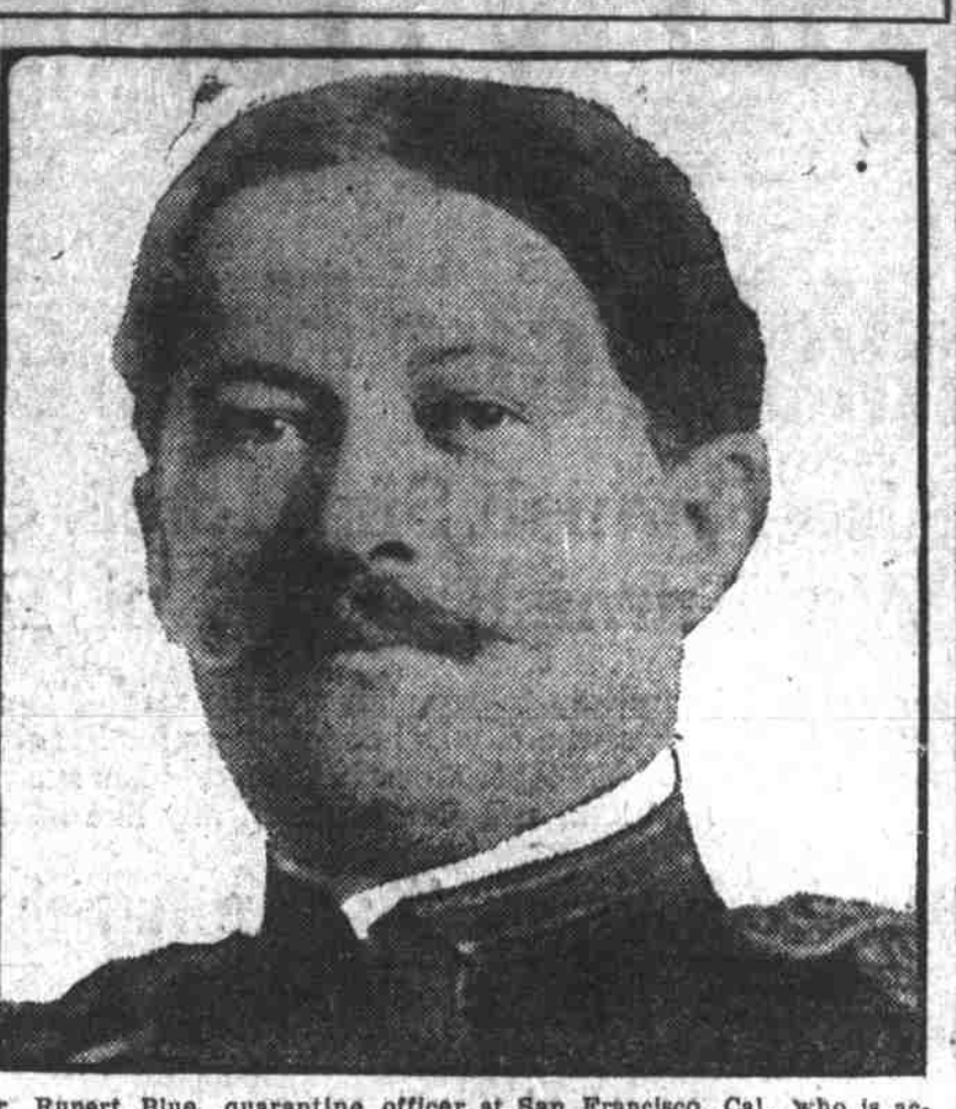
Dr. Rupert Blue, quarantine officer at San Francisco, Cal., who is actively in charge of the coast fight against the plague.

San Francisco, Nov. 21.—So much discussion has arisen over the plague conditions on the coast that a special correspondent of this paper on the coast called upon Dr. Rupert Blue, quarantine officer at San Francisco, to see what the facts were. Dr. Blue gave some astonishing figures which show that the condition is not nearly so serious as has been generally supposed.