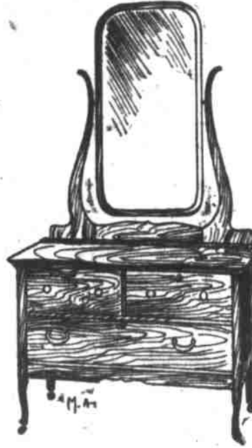
No. 100—This Solid Oak Princess Dresser, reduced from $18.50 to $14.00. Fine plate mirror 18x36. A joy, to any woman.