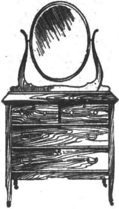
No. 421—Genuine Oak Dresser, special, $12.75. Has best plate mirror 22x28.