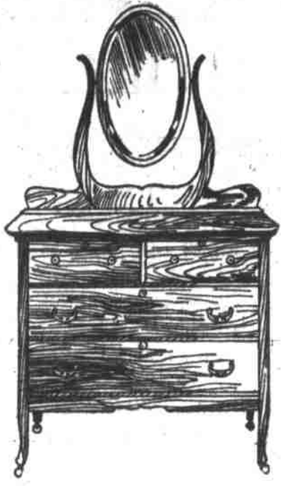
No. 415—Genuine Oak Dresser, special, $10. Very best workmanship. Good mirror 14x24.