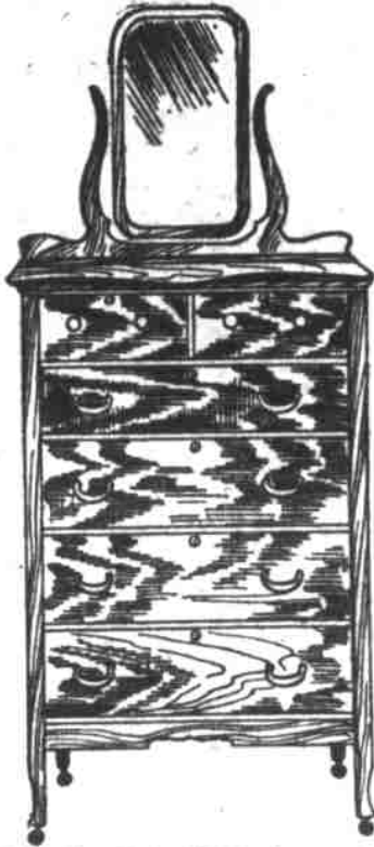
No. 61—Oak Chiffonier priced low at $13.25, special, $10.00.