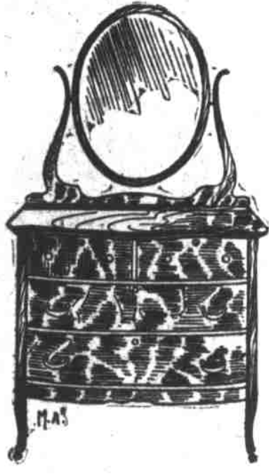
No. 621—Solid oak, full swell, quartered oak front, special, $15.00.