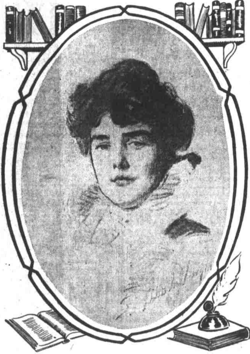
Lady Randolph Churchill, a Portrait Sketch by John S. Sargent.