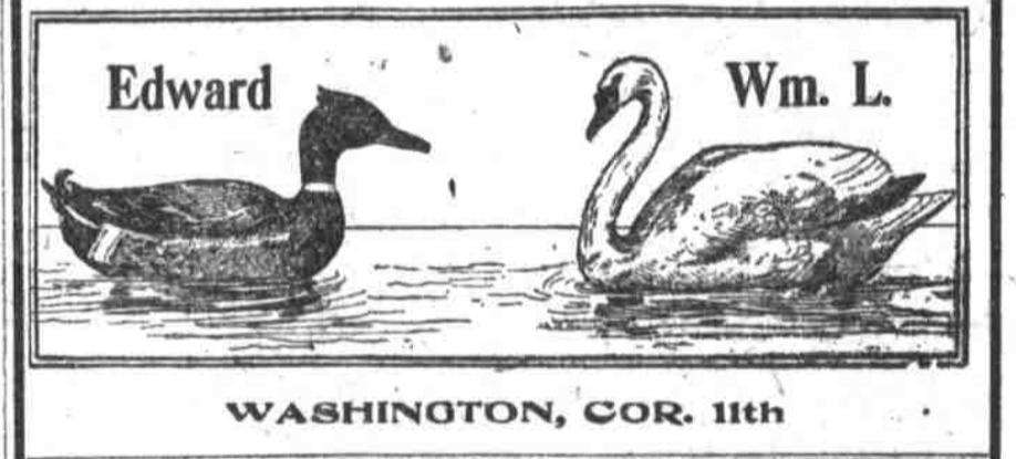
WASHINGTON, COR. 11th