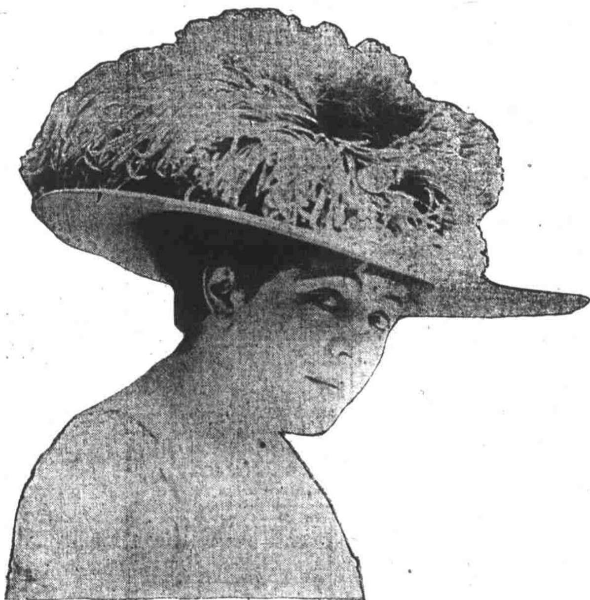
VALESKA SURRATT, the original Gibson Girl, posing in a Georgette model for VOGUE. This same hat and the original photographs on display at Lipman Wolfe & Company's Millinery Section. Original price $175.

By special arrangement with VOGUE, the fashion magazine of the elite, we have arranged for a display in our Millinery section of the Paris hats imported by VOGUE. These hats, worn by Valeska Surratt, the original Gibson Girl, and posed especially for VOGUE, are on display, together with a photograph of Valeska Surratt wearing each hat. You are invited to view them as well as our superb window display on Washington Street