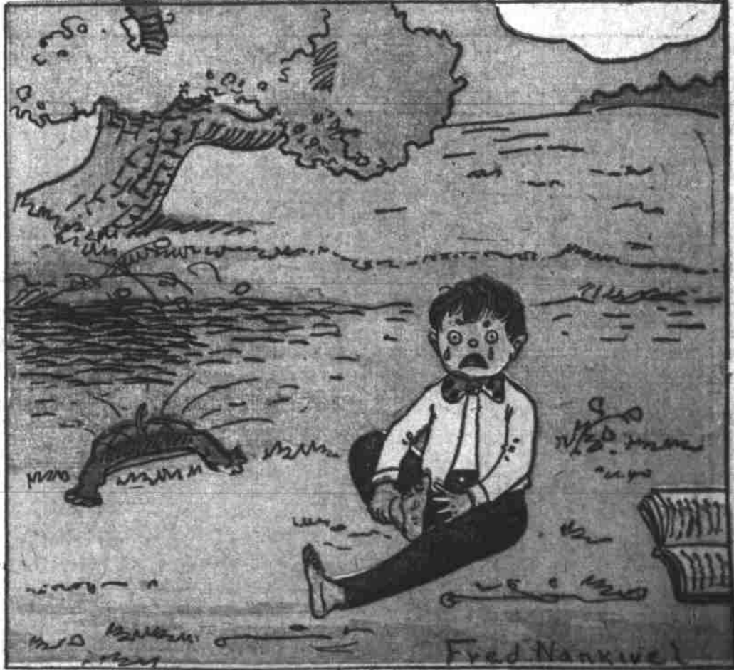
"T-U-R-T-L-E—turtle; that word I surely know; And T-O-E I can't forget, because it was my toe."