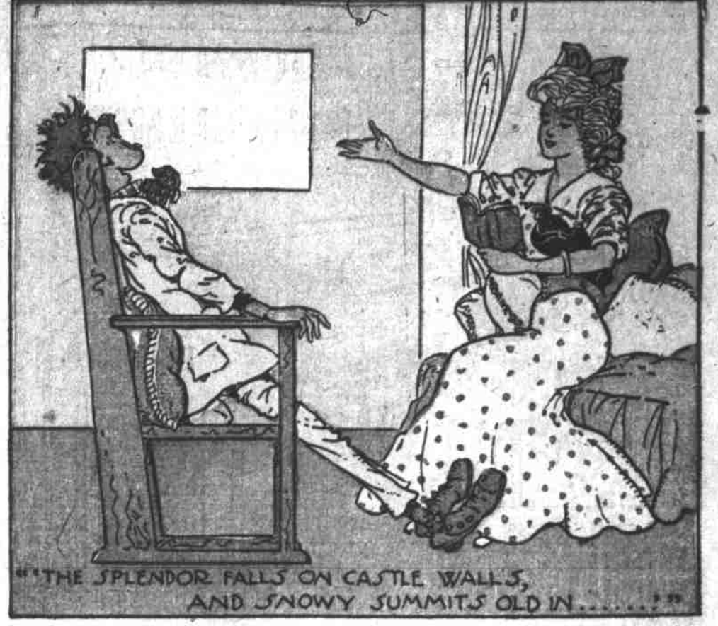
"THE SPLENDOR FALLS ON CASTLE WALLS, AND SNOWY SUMMITS OLD IN....."