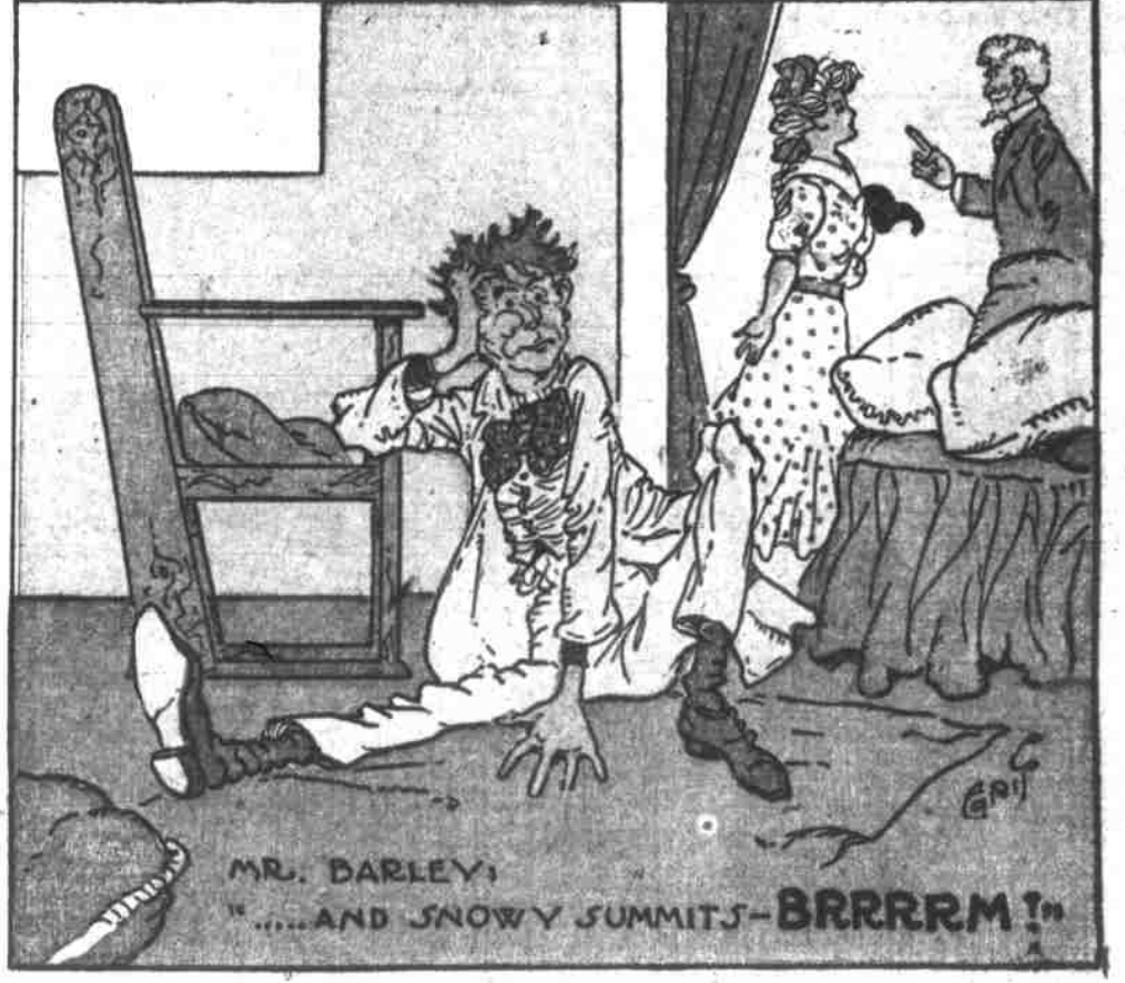
MR. BARLEY: "...AND SNOWY SUMMITS--BRRRRM!"