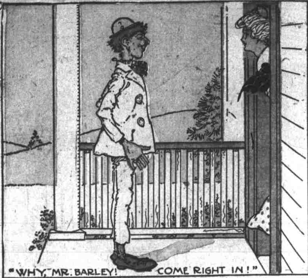
"WHY, MR. BARLEY! COME RIGHT IN!"