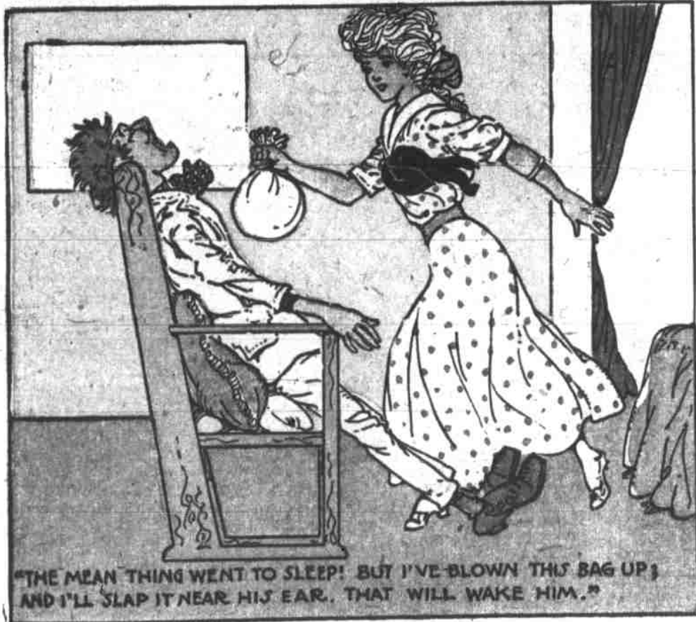
"THE MEAN THING WENT TO SLEEP! BUT I'VE BLOWN THIS BAG UP, AND I'LL SLAP IT NEAR HIS EAR. THAT WILL WAKE HIM."