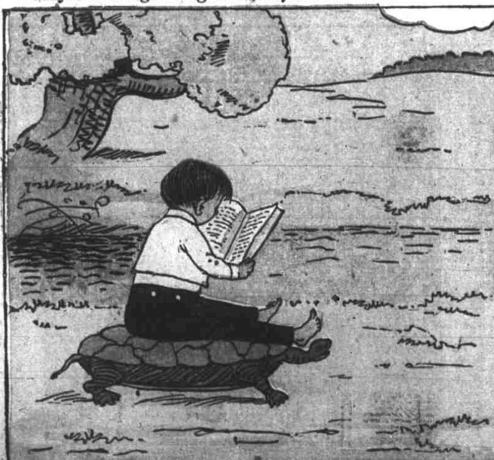
"The next word in my lesson is a short one—T-O-E—I wonder why my lesson is so very hard for me."