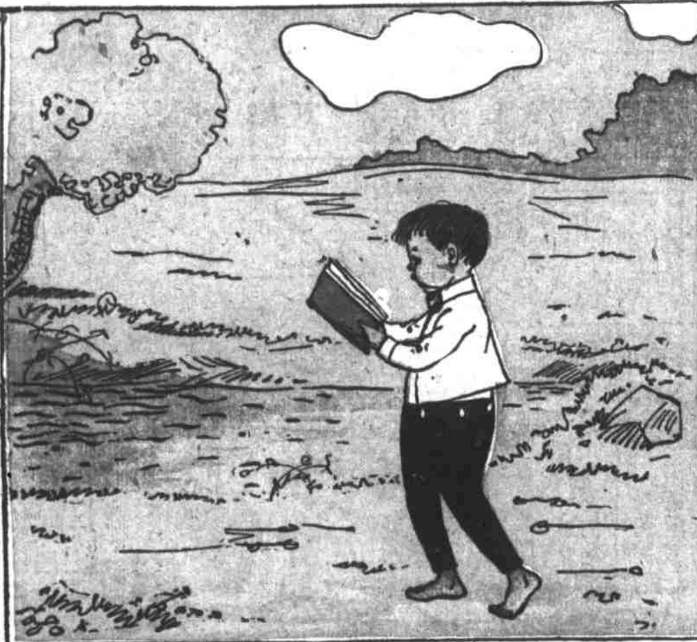
"Now T-U-R-T-L-E spells something—I'm sure of that. Maybe it is a great big horse, maybe it is a rat."