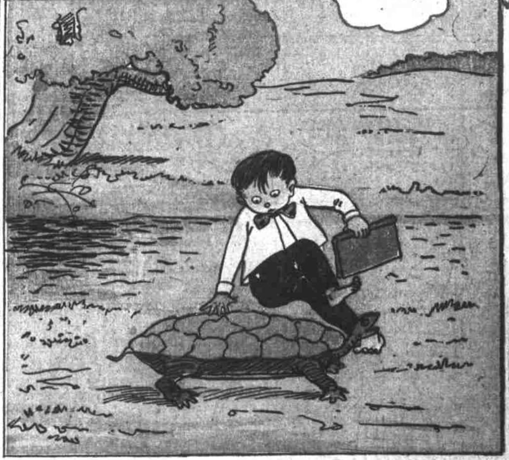
"You look so big and strong, I think that I will take a ride." And straightway on that turtle's back young Teddy sat astride.