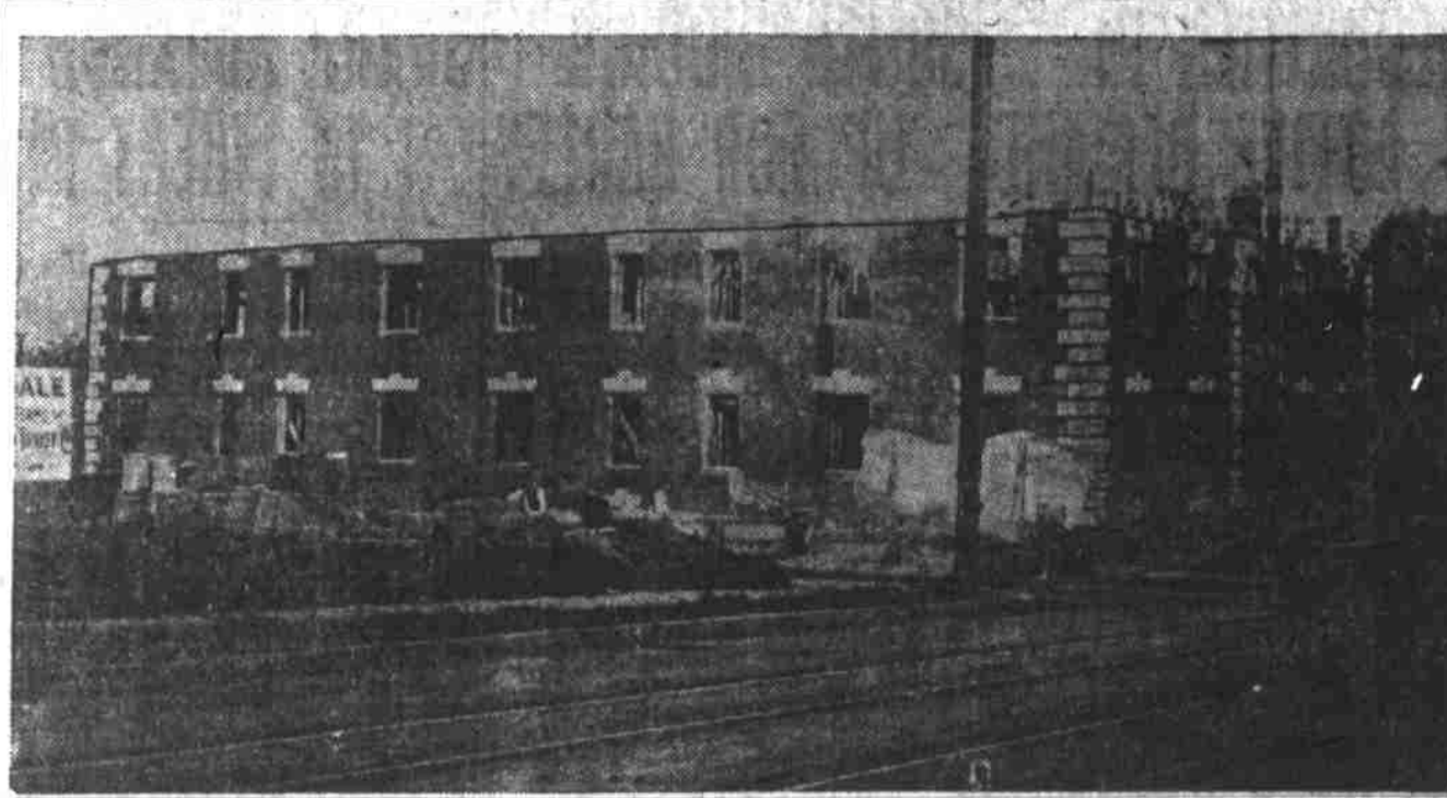
New Brick Apartment House at King and Washington.

(Special Dispatch to The Journal.) Chicago, Ill., Nov. 7.—A delegation representing the Chicago association of commerce has arranged to leave this city tomorrow for a tour of the southern states. The object is to promote closer trade relations between Chicago and the south. The party will travel by special train and will visit numerous points in Kentucky, Tennessee, Alabama, Louisiana and Mississippi.