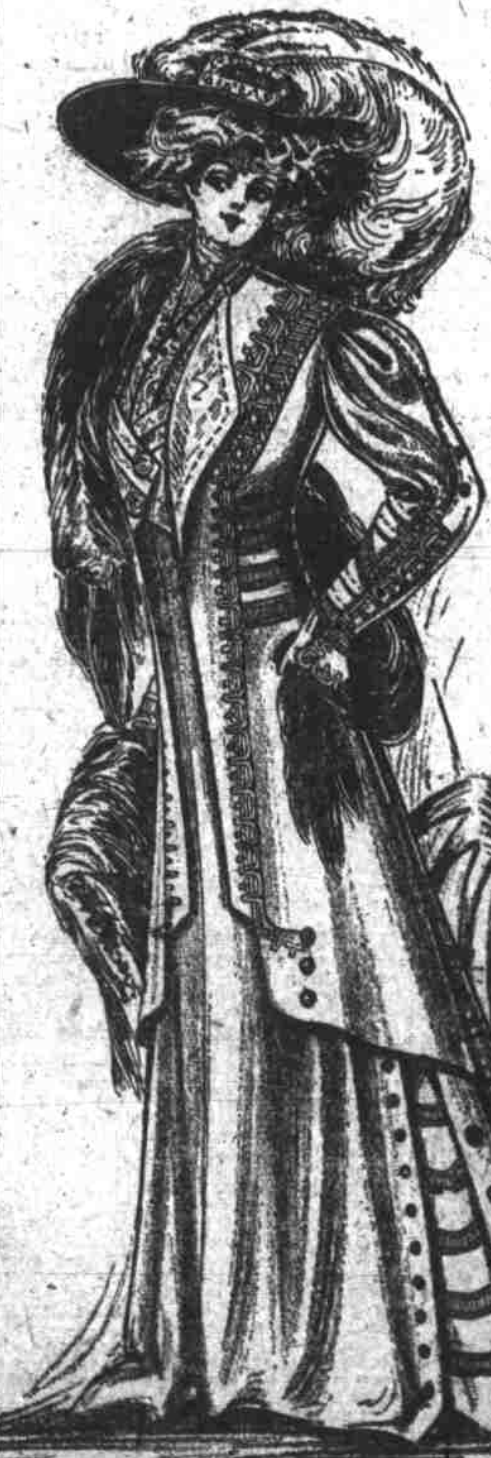
The illustration shows one of our handsome new costumes posed on a living model.

Costumes for afternoon and evening wear, fancy Tailored Suits for street or dress, new smart Coats for out-of-doors, and rich Opera Coats.