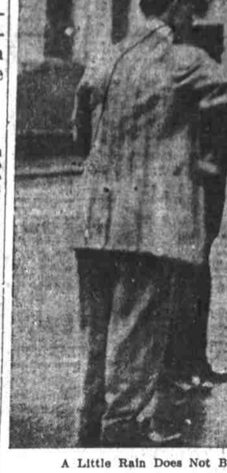
A Little Rain Does Not Bother This Fair Tag-Seller.

Chinese gambling games in Portland must be closed, says the city executive board. The board has decided to stop Chinese gambling at all hazards and the plan is to get the men "higher up." The owners of buildings occupied by Chinese where gambling is known to have been going on in the past are to be notified, officially, that unlawful games are being conducted in their buildings and that they, too, will be held responsible if arrests are made.