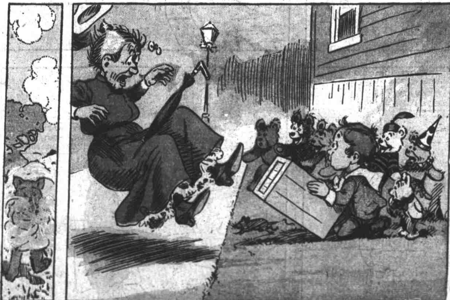
5. "Open the box, you bad, bad boy!" The Teds obey, nor hide their joy. The rat leaps out to get away And fills the lady with dismay.