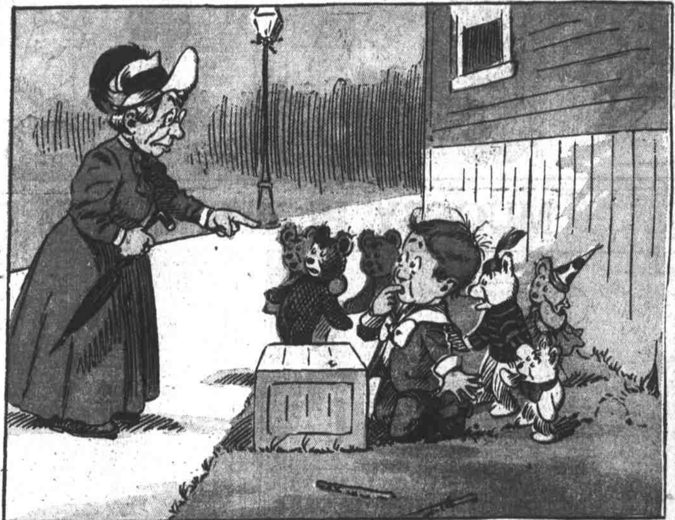
4. "You naughty boy!" she straight declares, "With all your silly, naughty bears, I'm sure you're up to wicked tricks, And some poor creature's in a fix."