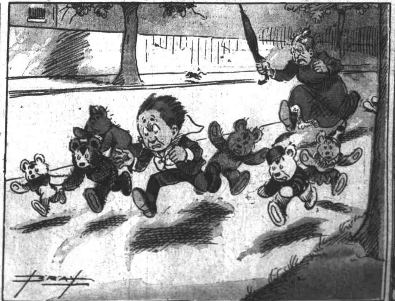
6. But her recovery is quick, And grabbing her umbrella stick, She quickly tries to make things square, But finds the villains are not there!