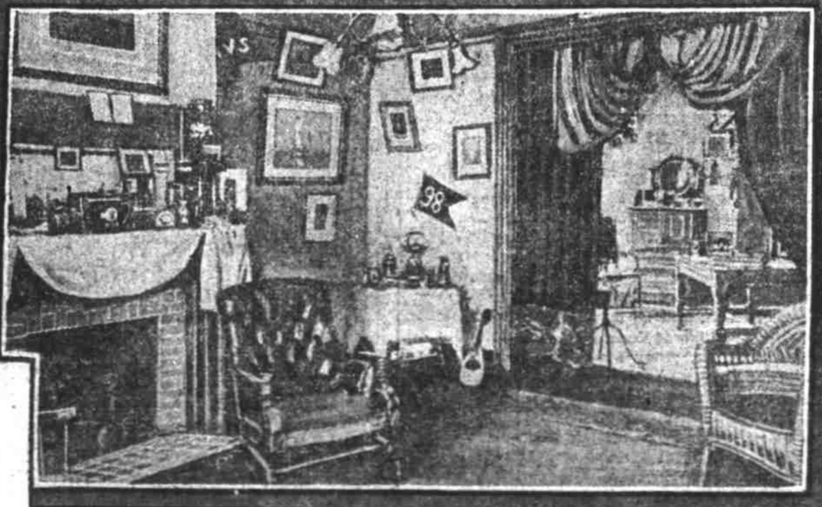
Private Suite in a Yale Dormitory.

costly curios, expensive books, etc., he may have to occupy a hall bedroom at $1 or $1.25 a week.