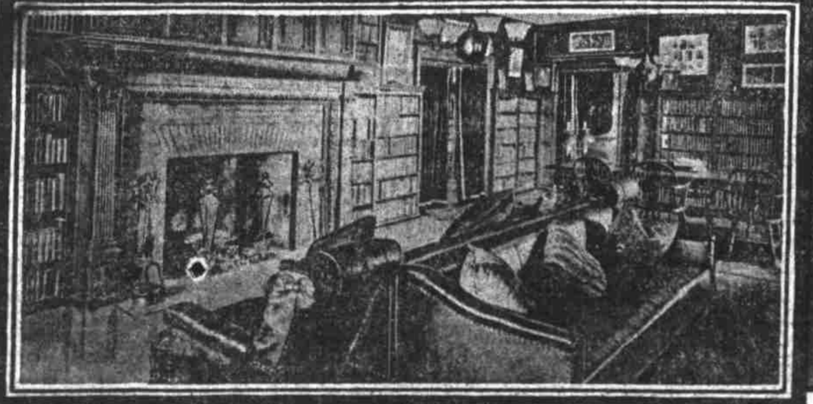
A Room in Princeton's Ivy Club.