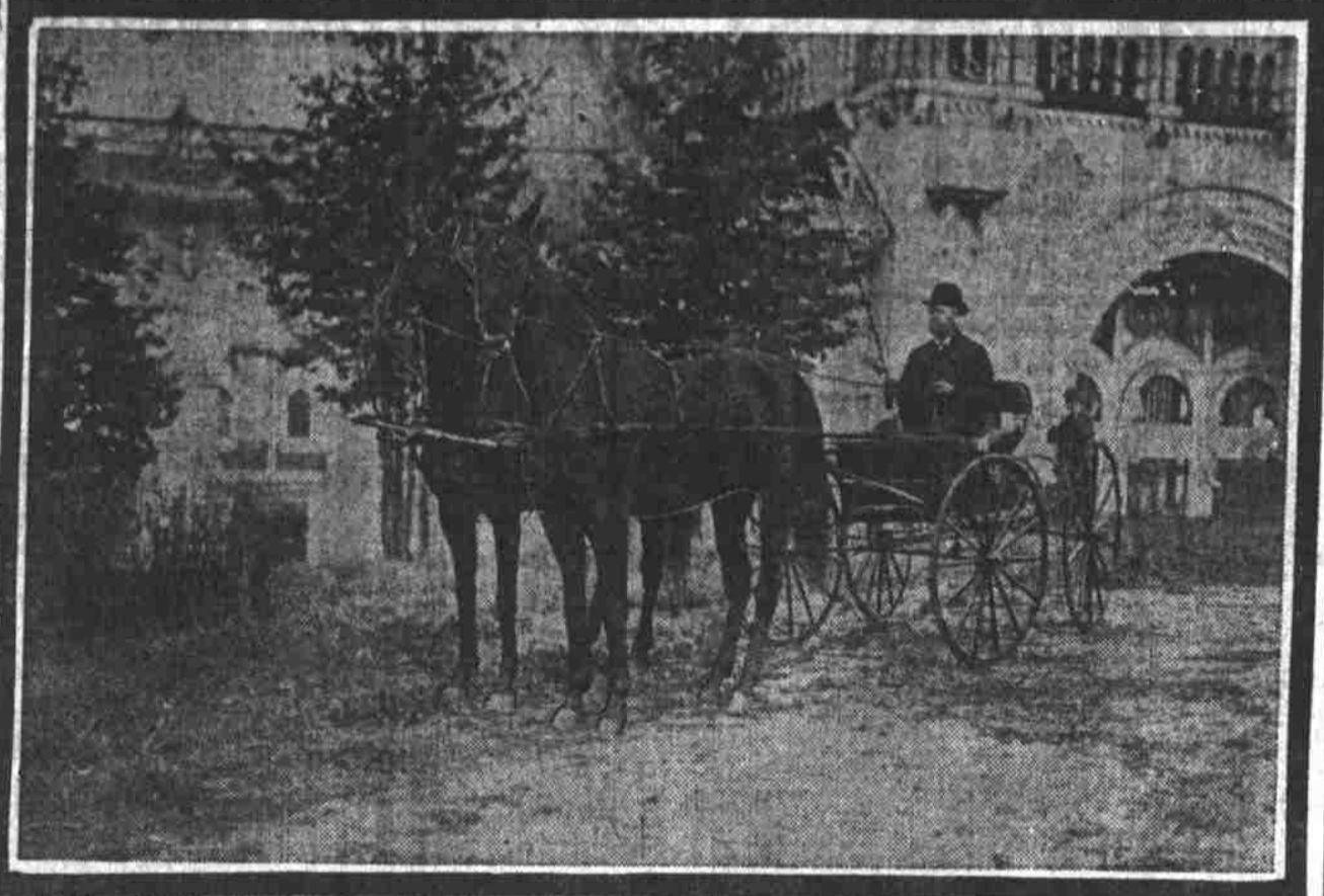
Paul Wessinger's Alta Cora and Cora Patchen.

Society Out in Force. As a spectacle the interior of the Oriental building last night was a remarkable sight. By 9 o'clock the boxes and reserved seats had been filled with their quota of fashionably-attired men and women. The big circle around the sawdust ring was a bewildering mass of color which is not for mere man to dissect. But the thousand and one box occupants each arrayed as shepherds in plumage and fine ornament and many jewels, if they served no other purpose to the horse lovers, at least made a gorgeous background for the handsome animals on exhibition.