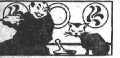
PROVIDED WITH A DINNER

"The gods have provided me with dinner!" cried he. And as he proceeded to