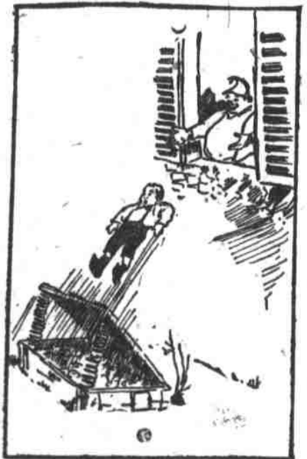
THE BOY SHOT UPWARD

Then, as he released the staple which fastened the lid of the box, a strange thing happened. The lid flew backward