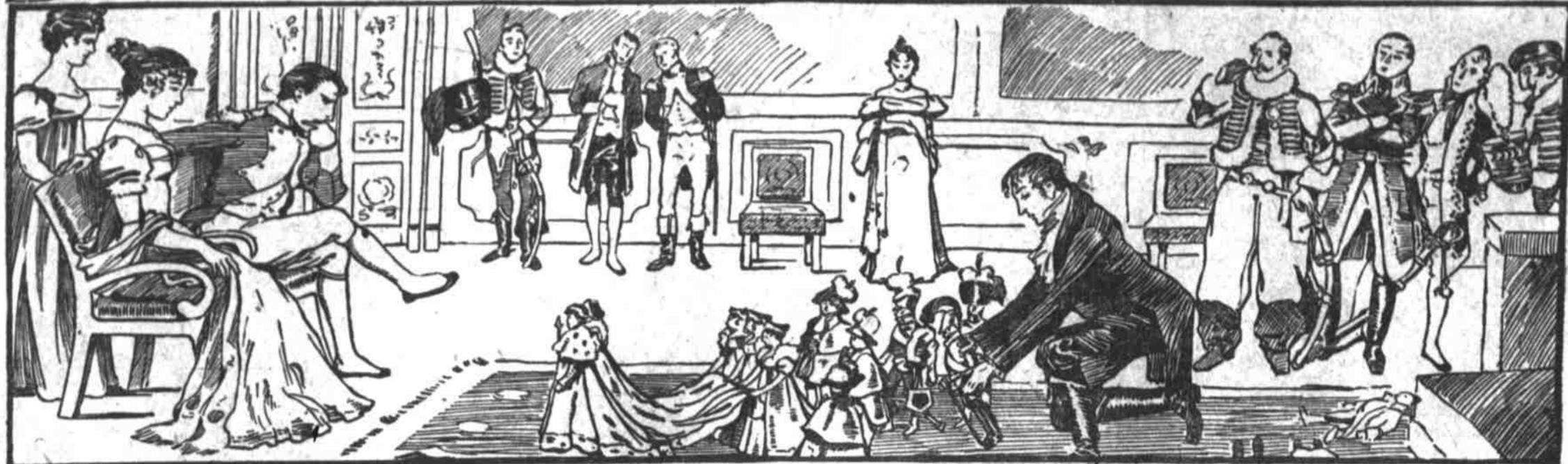
THE ARTIST QUICKLY ARRANGED THE WONDERFUL DOLLS IN A PROCESSION BEFORE NAPOLEON

"Ah, there is nothing to disturb me today. I can now devote the time necessary to finish this portrait."