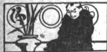
WENT PLACIDLY TO SLEEP

Kitao composed himself to sleep. True, he had not dined, but he was contented, for all that. Had he not given his last handful of rice to the poor? Surely, he would gain much more good from it in this way than had he eaten it.