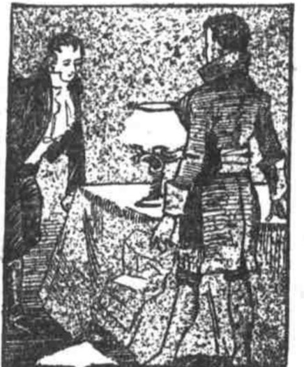
SUMMONED BY NAPOLEON

do the work," he reflected. All at once an idea came to him. Not only was he clever at painting, but he could devise splendid costumes with remarkable speed. Mme. Isabey was witty.