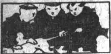
FASTENED THE SAUCUPAN

She had gone not more than a hundred yards from the cottage of her master, however, before she met several naughty boys, who wickedly tied a huge saucupan to her tail. Terrified by this great thing, which banged and clattered