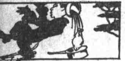
DROPPED THE PULLET

So great was her fright that she did not realize what she was doing when she ran against the royal cook, who prepared the viands for the emperor himself. Now, the cook was carrying a pullet, which had just been cooked for his majesty, and when he fell, tripped by the string attached to Matou's saucupan, he dropped the chicken.