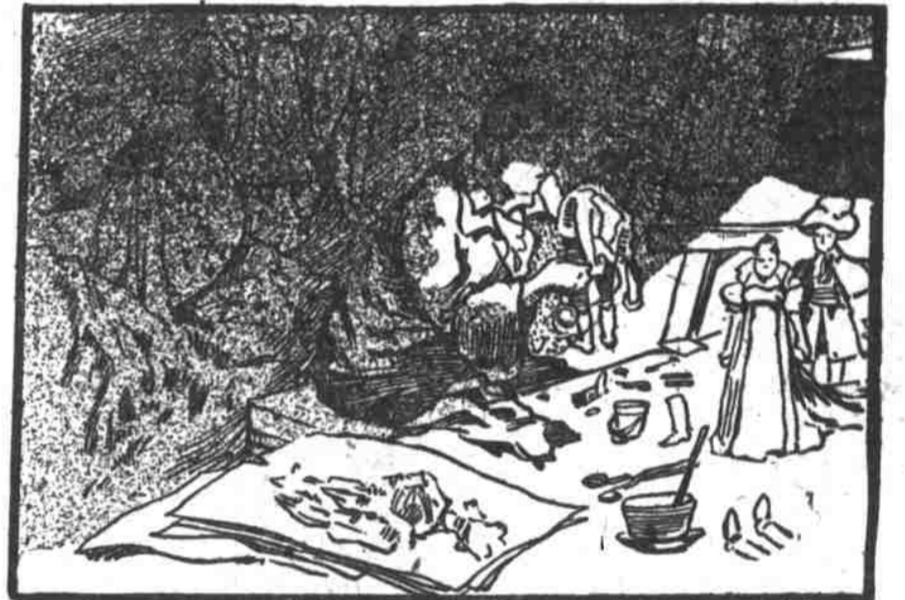
ISABEY'S ROOM LOOKED LIKE A DOLL FACTORY.

Isabey acknowledged this compliment and the praise bestowed upon him by