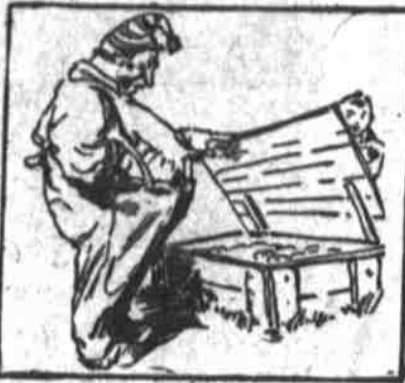
GREAT WAS HIS WRATH

MR. BROWN looked into the great box, sunk deep in the ground, which stood near his house. The longer he gazed the more wrathful he became. Here, you see, he had stored the apples plucked from the choicest trees in his orchard; and now some thief had made great inroads into the supply.