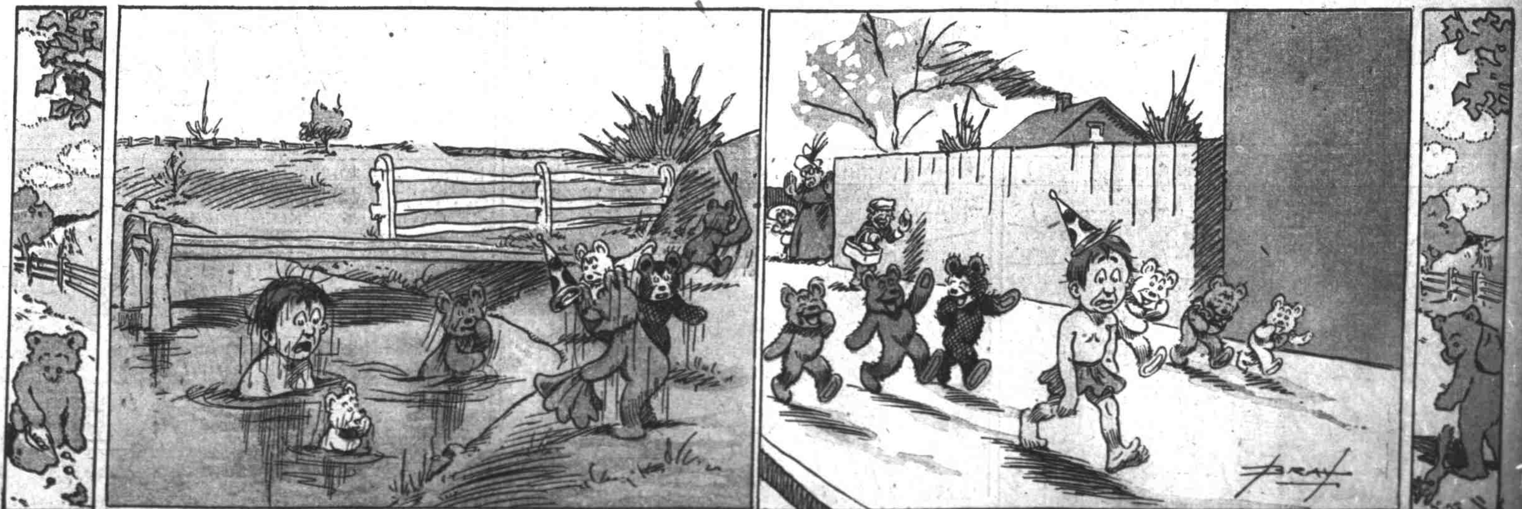
5. Oh, woe! oh, grief! What shall we do? The goat's gone, but the clothes are, too. A clown's cap and a skirt are there, But these belong to Teddy Bear.