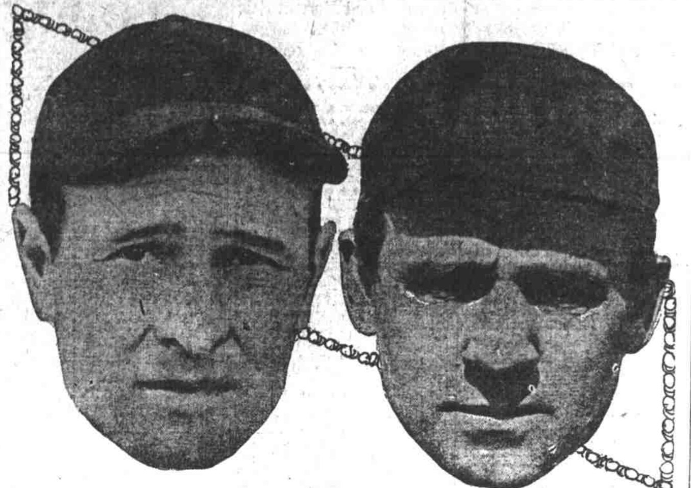
Frank Chance of the Chicago Cubs on the Left and John McGraw of the New York Giants to the Right, Who Will Fight It Out Tomorrow, Probably.