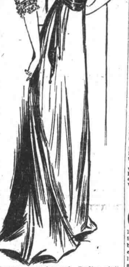
Dinner gown of tussah. Bodice plaited from shoulders and held in place in front by a curved section braided with the material. Upper sleeve and bodice portion of meshed fillet embroidered in pastel shades.

THERE is a personage in Paris who could tell you why the styles in hairdressing change, and, what is more, he could accurately predict the coming hairdressing fashions.