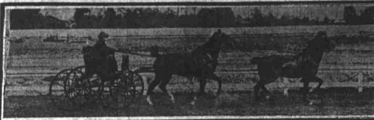
T.B. WILCOX'S "HINDOO PRINCE AND BLACK CHIEF"