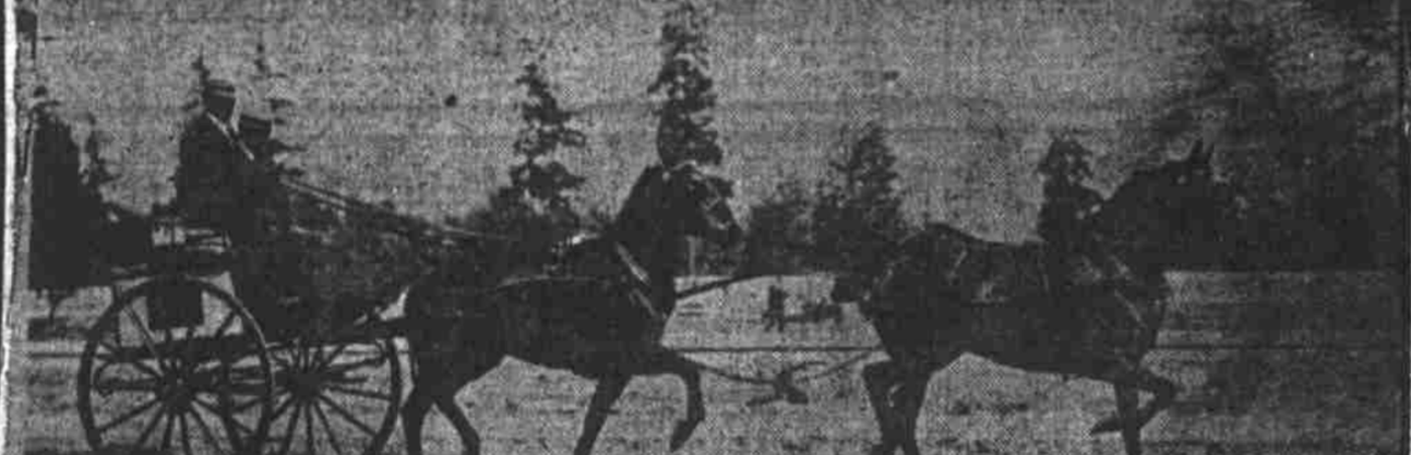
H.W. TREAT'S "HUCKELBURY AND STEP LADDER"