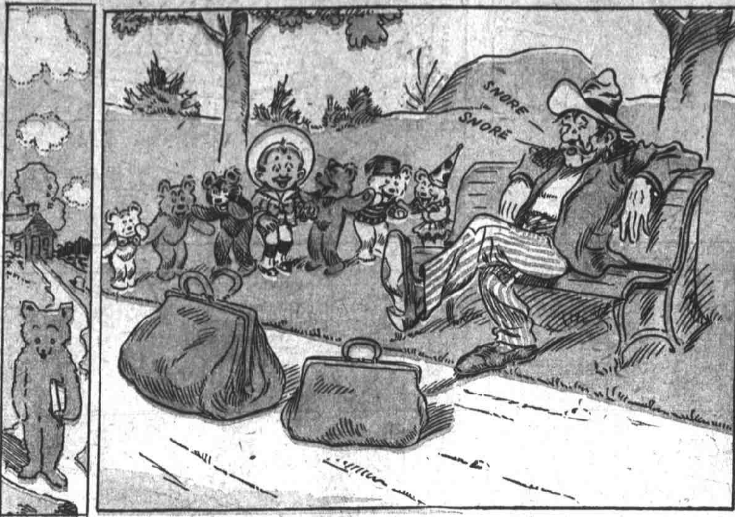
1.—A peddler snoring off his cares, A naughty boy, some naughty bears. Behold the actors in the play Upon a peaceful summer day.

PORTLAND, OREGON, SATURDAY EVENING SEPTEMBER 26, 1908