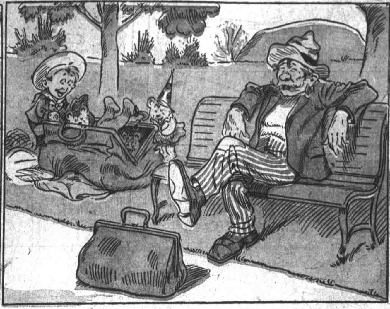
2.—The peddler's bag is opened wide, And Johnny pops the Teds inside. It's rather tight, but they don't mind— And not a one is left behind.