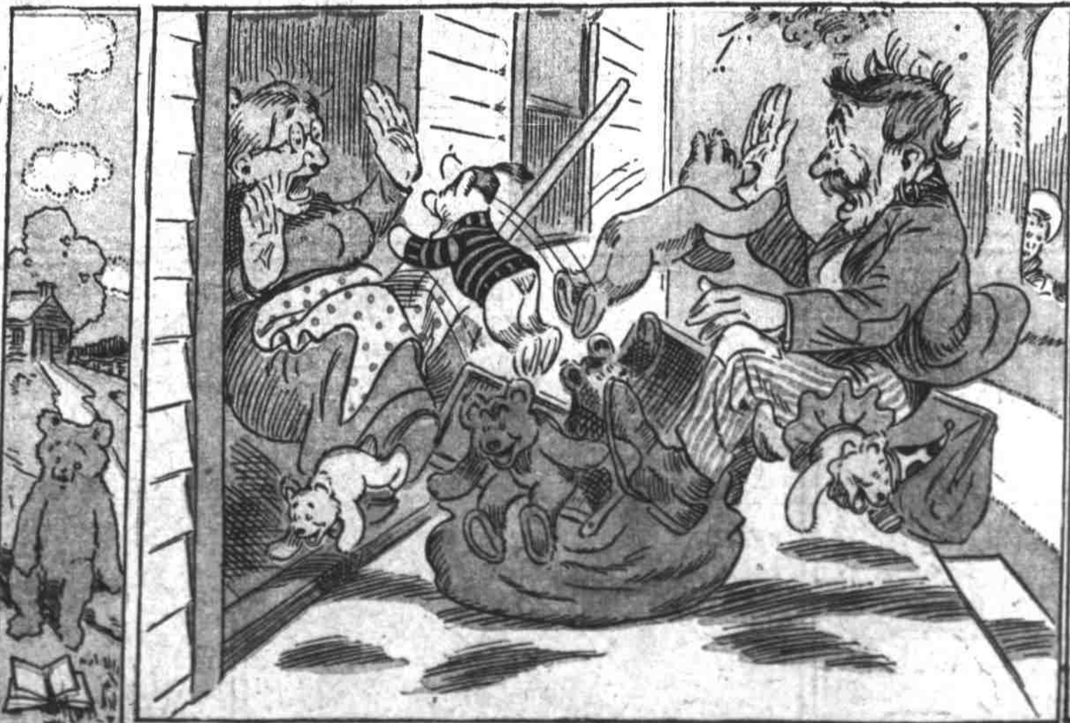
5.—At last she bids him show his wares. Hurrah! Out jump the Teddy Bears. "Oils, unguents, poultices," they yell, "And real, live Teddy Bears as well!"