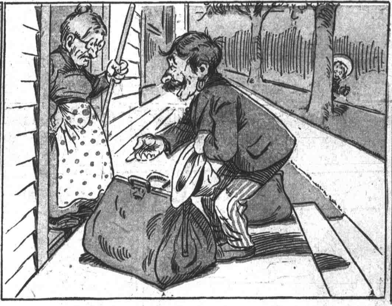
4.—And now just hear that peddler try To make a farmer woman buy. He tells of oils and unguents sweet, And poultices for weary feet.