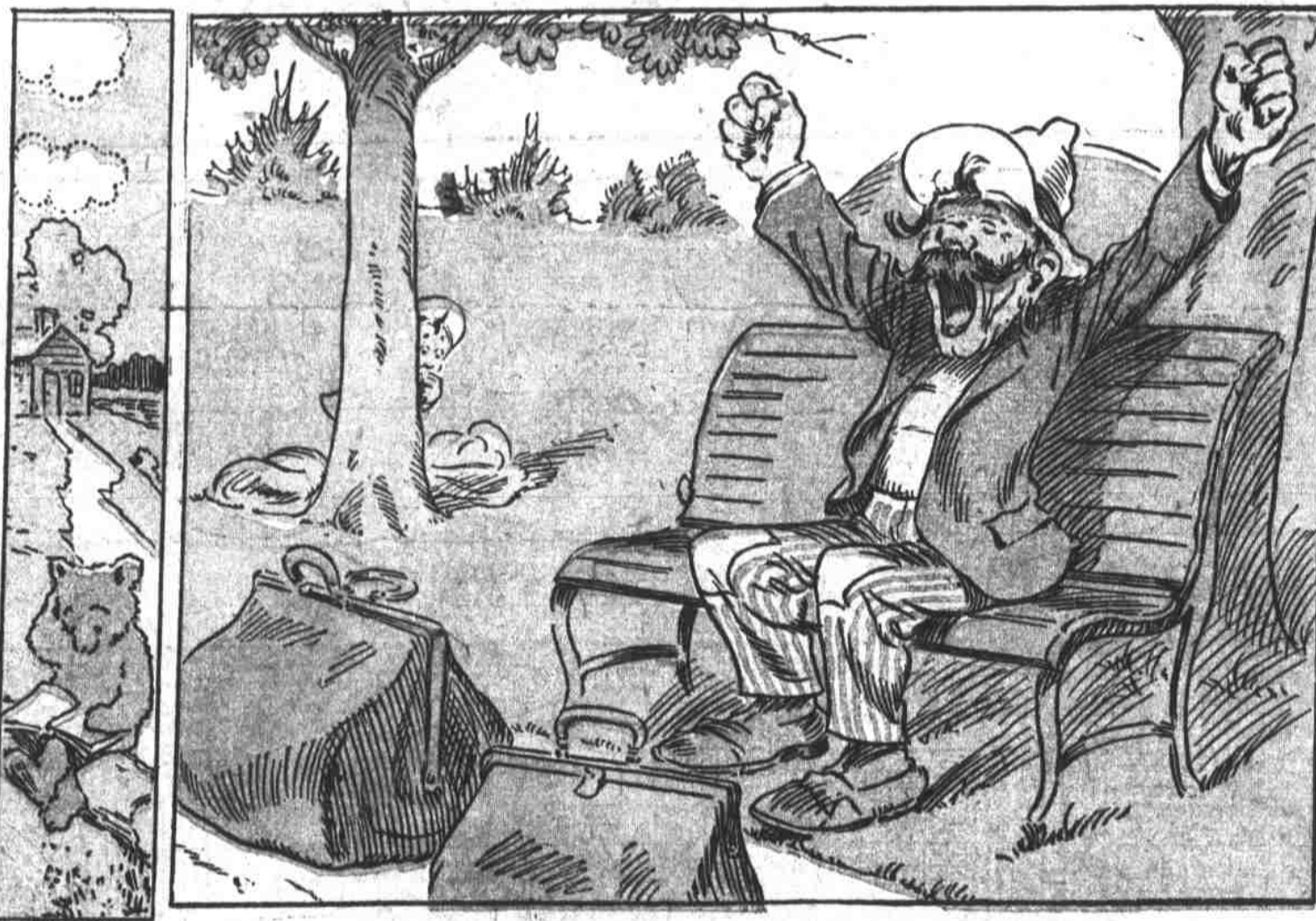
3.—At last, with one enormous snore, The peddler wakes, to sleep no more. He takes the bag up heavily, While Johnny hides behind a tree.