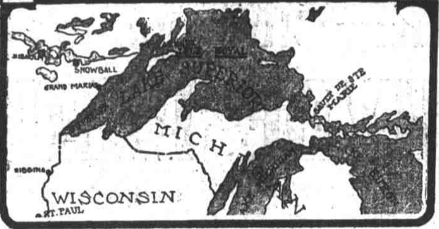
Shores of Isle Royale, in Lake Superior, and Map showing the location of the greatest Forest Fires of recent years.

The awful fate of Chisholm and Snowball, in the northern part of Minnesota, are only part of the disaster which has befallen this part of the country. Grand Marais, on the lake, this city and any number of others have only escaped by miracle. Just as the fires approached the outskirts of the city, rain fell and checked the flames. Thousands and thousands of dollars have gone up in smoke in the last three days, and the city of Duluth alone has raised $25,000 to relieve the want and deprivation of the range towns. The extensive forests