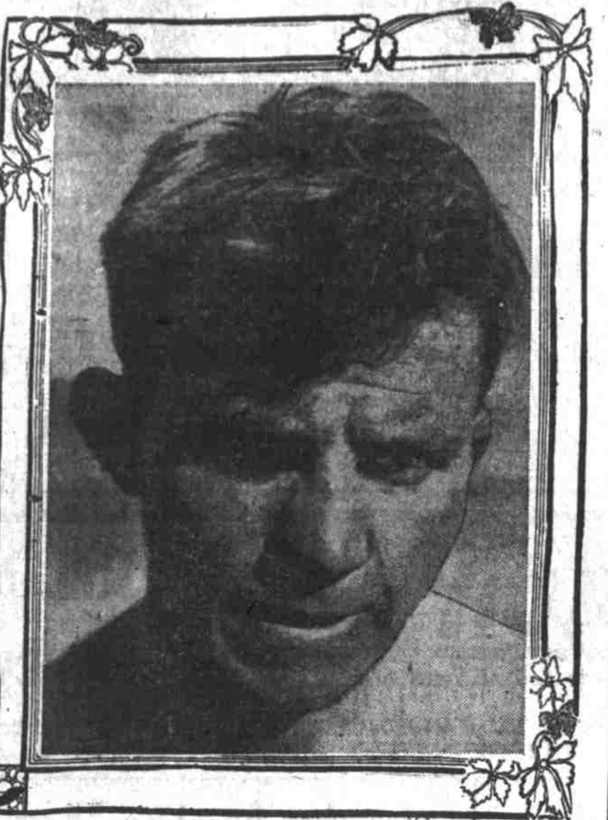
Champion Battling Nelson.