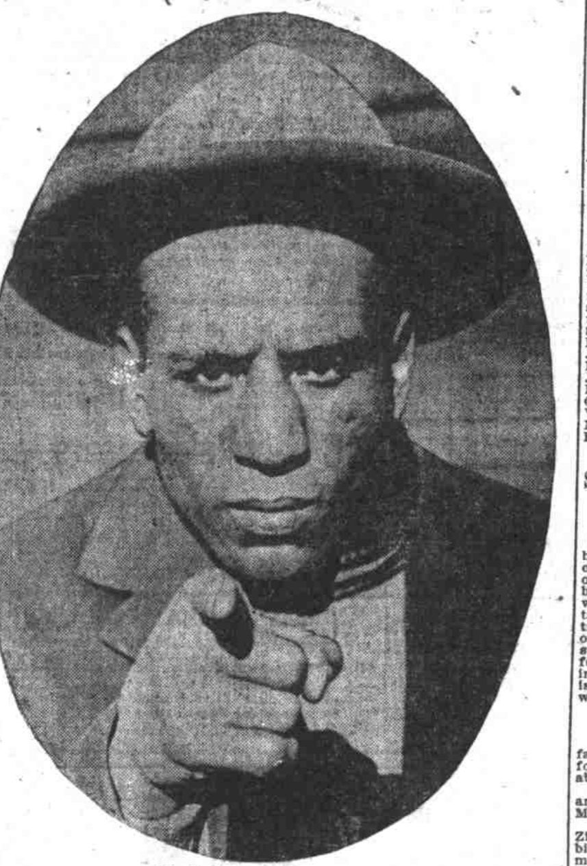
Challenger Joe Gans.