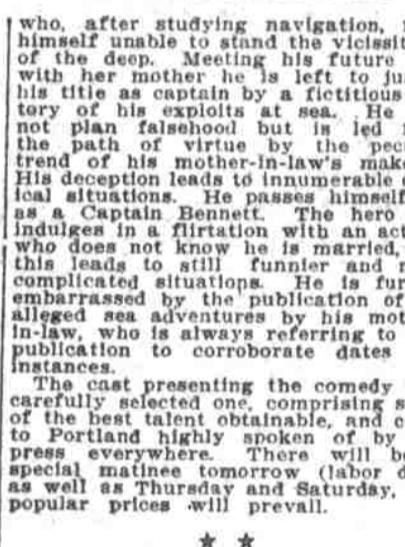
Hooligan at the Star.