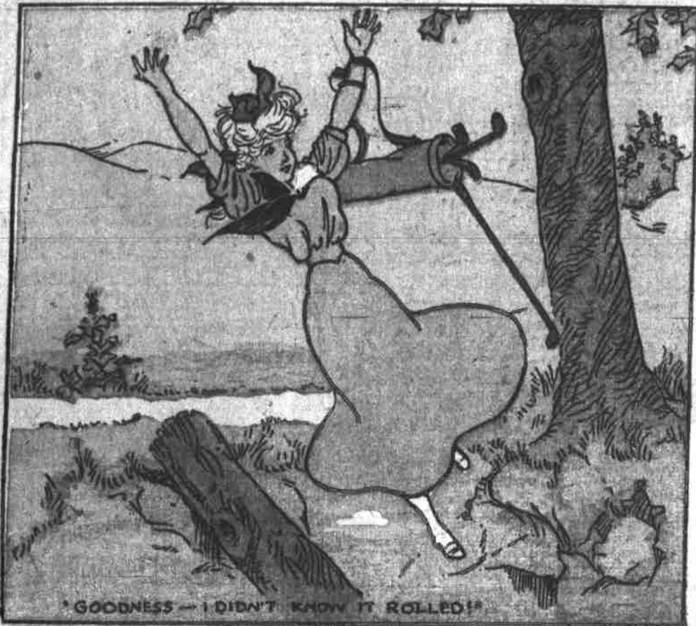
"GODNESS-- I DIDN'T KNOW IT ROLLED!"