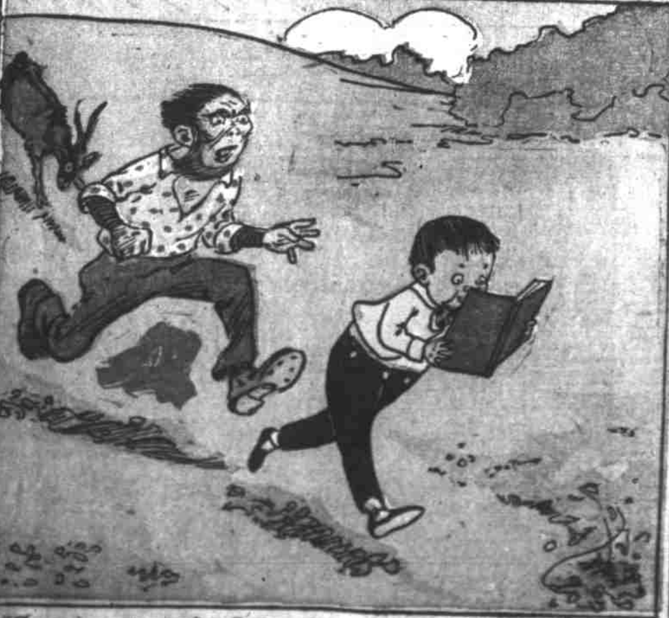
"Go-a-t--you see that I am on my way to school. And I must study hard each word. That is the teacher's rule."