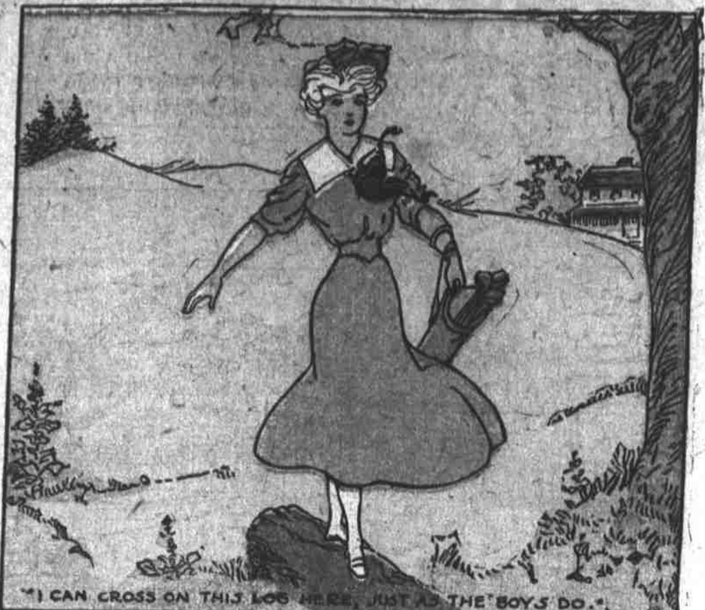
"I CAN CROSS ON THIS LOG HERE, JUST AS THE BOYS DO."