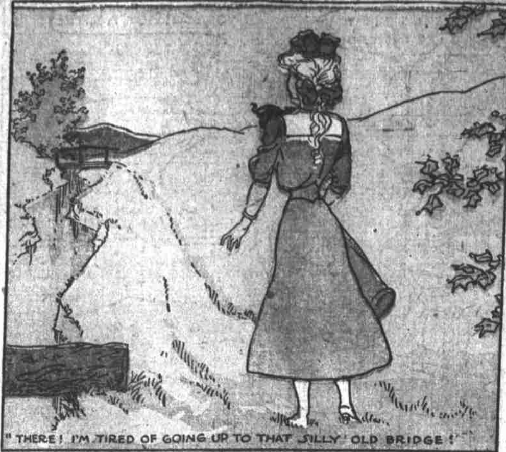
"THERE! I'M TIRED OF GOING UP TO THAT SILLY OLD BRIDGE!"