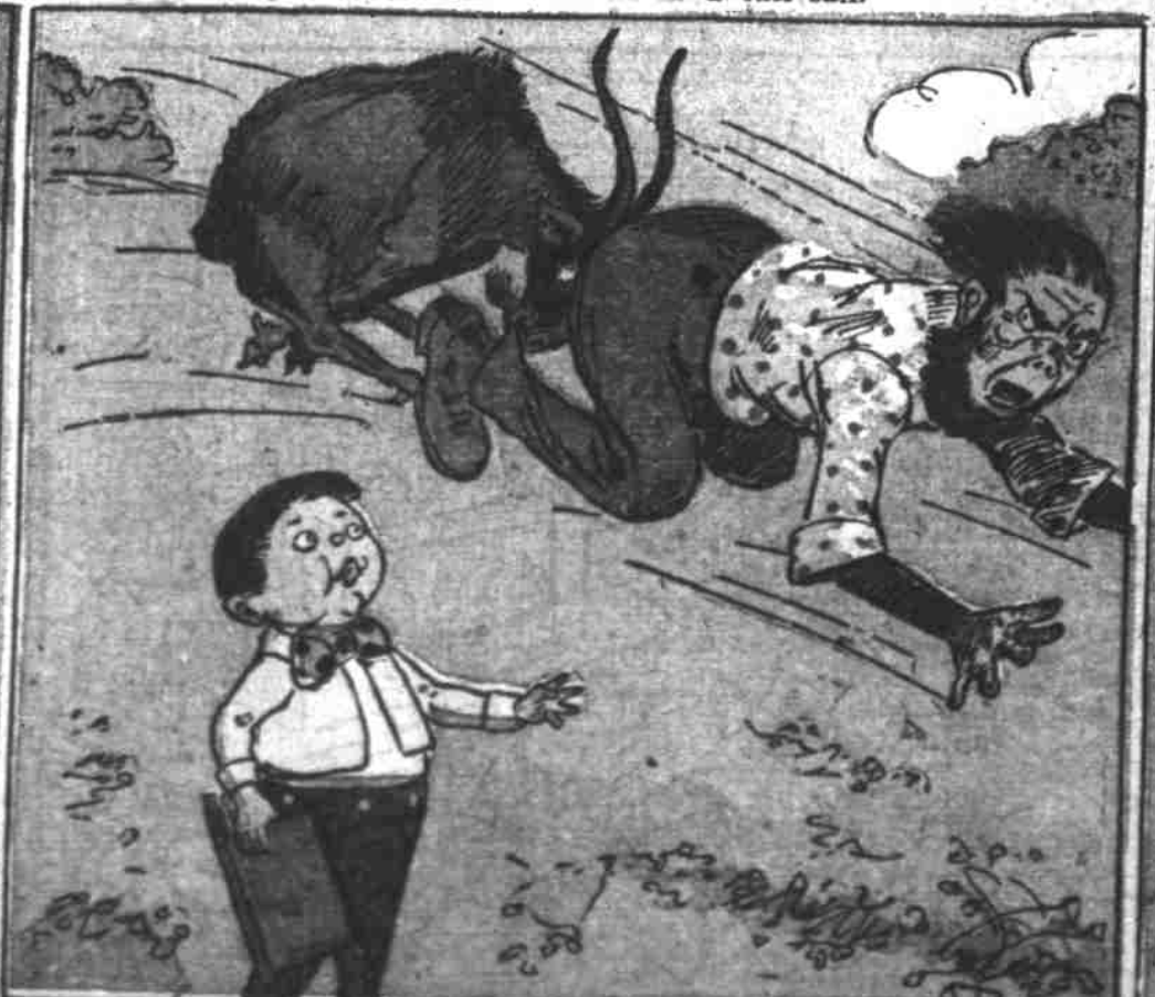
"Ha, ha, he, he; yes, there it is--a goat, a billy goat. He gave that man an-awful bunt. Oh, dear, just see him go-it!"