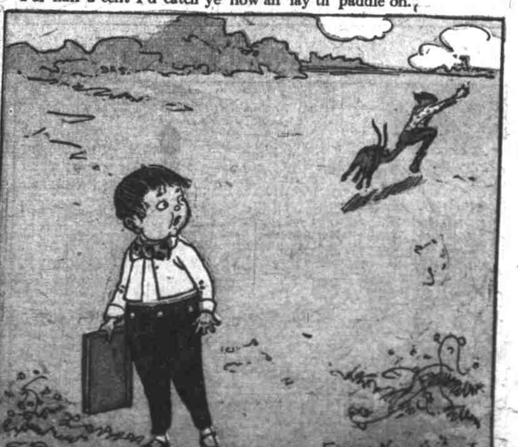
"Now, what does d-i-n-n-e-r-p-a-i-l spell? Why, dinner-pail; and g-o-a-t, goat. I know that well."