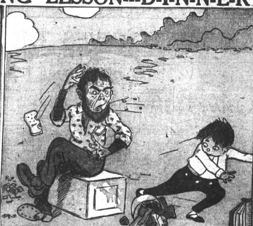
Oh! Oh! Wyow! Wyow! There, I know now; that word is dinner-pail. I'd better get right out of here as fast as I can sail."