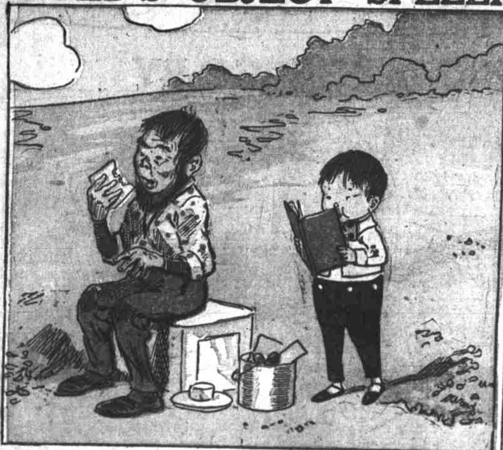
"Now what does d-i-n-n-e-r-p-a-i-l spell?" The teacher said. "Be sure to know your lesson well."