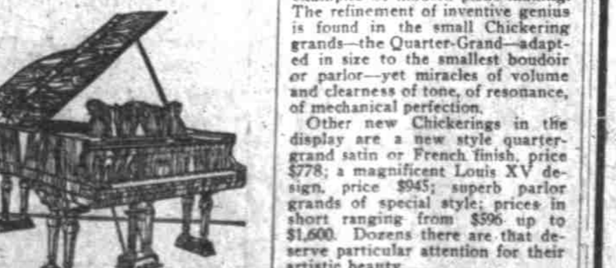
Superb Parlor Art Grand. Price $1,250.