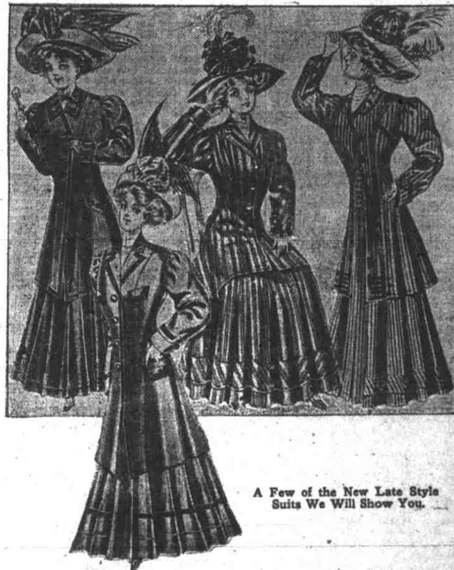
A Few of the New Late Style Suits We Will Show You.