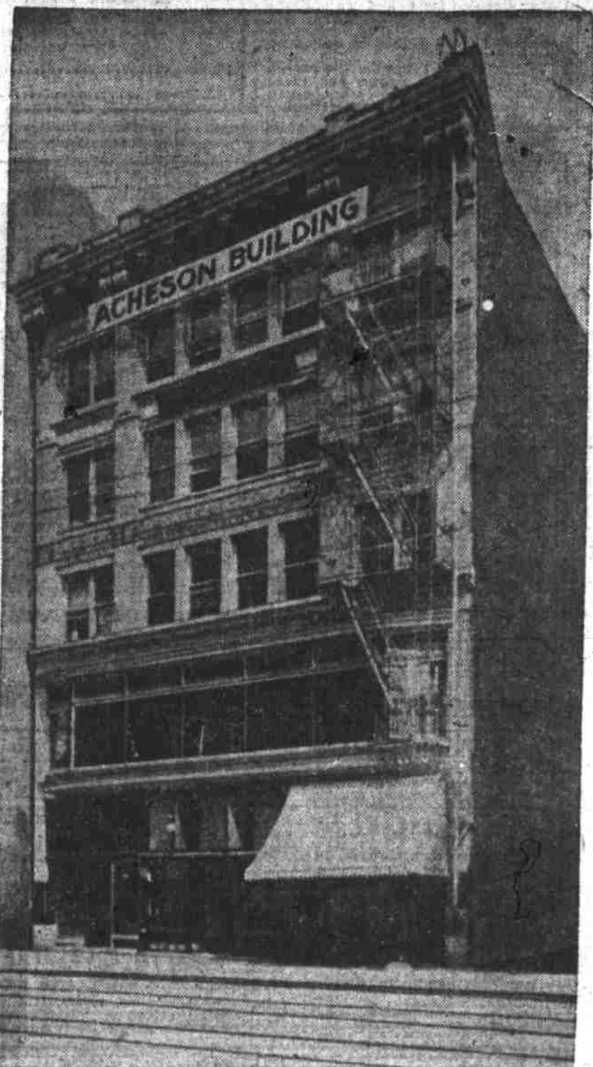
We Are Located in the Acheson Building, Two Floors, 148 and 150 Fifth Street.

We have no room here in this announcement or opening ad to itemize, but say, notice our expense account for running this big garment store—the largest garment floor in Portland—$1.50—one dollar and fifty cents a day rent. It ain't worth mentioning, is it? Do you think such an expense will affect retail prices? Wouldn't think a fellow an idiot to have such a low expense and yet ask high rent and expense-eating prices for his goods? Well, we are going to take advantage of the opportunity to sell at low prices, and we will make some money—don't forget that—and you will save about one-fourth to one-third if you buy of us. Prices quoted to you are, and will be, very low, simply because we can afford to do so—nothing else. They will be so reasonable that they will be very noticeable to you. But let us remind you that trashy goods will not be found in this store. It makes a man sick to buy trash in New York. It will make anyone sicker to sell it. Hence you can depend on the goods, as well as the prices of our garments.