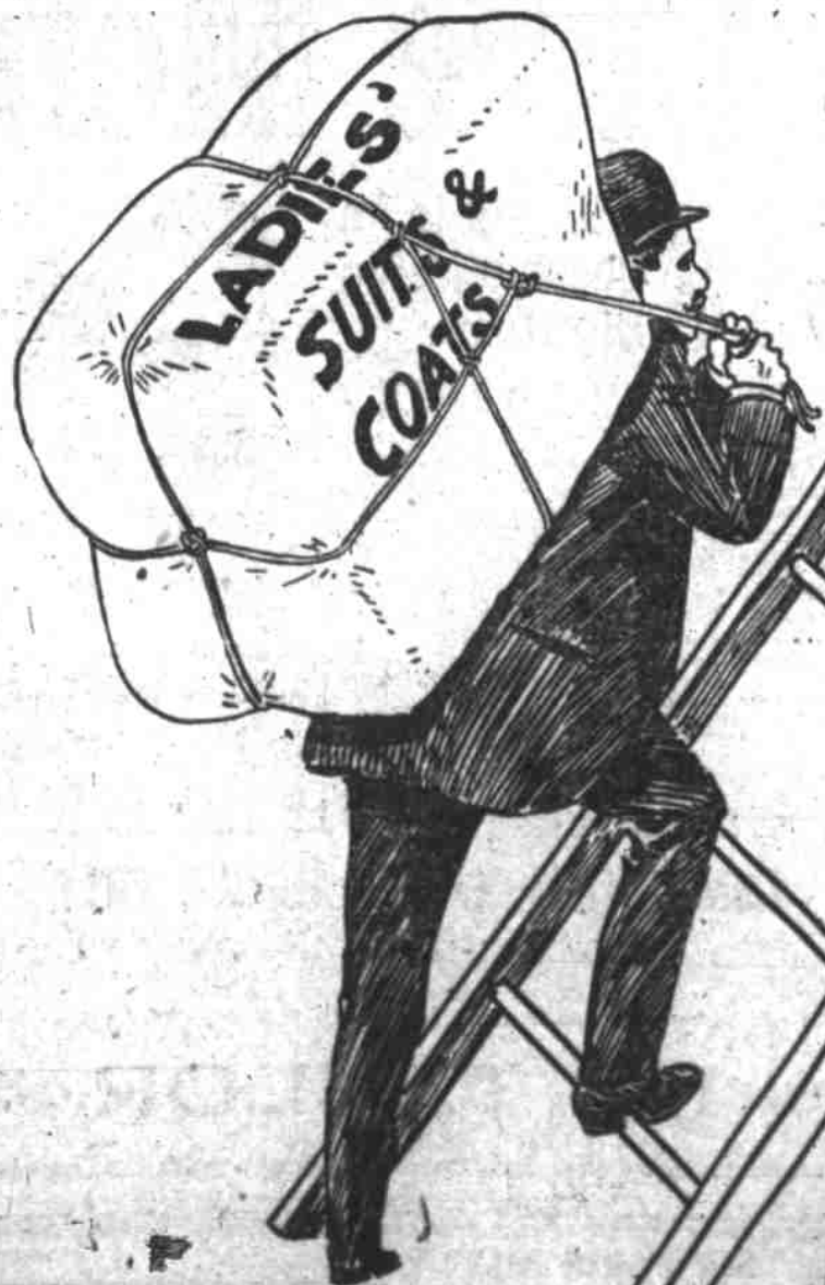
I'm Starting Up—Can't You Give Me a Lift?