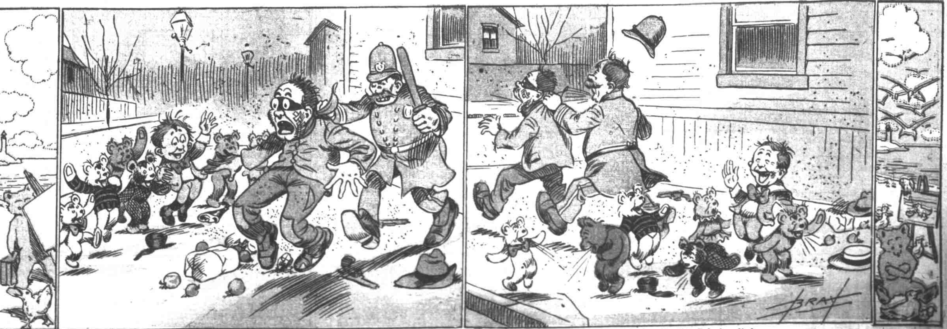
5. The deafening noise of sneeze and shot Attracts a policeman to the spot. He grabs the thief with wrathful cry— "Kerchew! kerchew! You're caught, me b'y!"