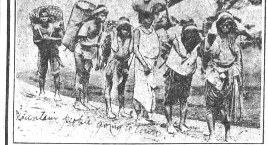
MOUNTAIN PEOPLE GOING TO TOWN.

Land Where All Manner of Man Dwells--Filipino Character Reverse of That of Natives That Daily Associate With Them--Queer Tribes and Their Stranger Customs