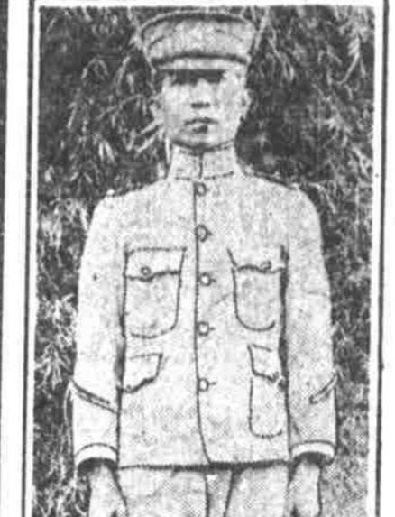
A COMTABULARY SOLDIER.

As the Igorotes live high up in the mountains, their rice fields are necessarily constructed at a cost of a great deal of labor. Great stone terraces are built up the sides of the mountain and water is brought from considerable distances in irrigating ditches. Long before the Spaniards came to the islands the Igorotes were wearing earrings of gold gotten out of the mountains of Benguet. Industrial schools are being established for these people and the prospect for making useful citizens out of them is very bright. The largest and most important of the non-Christian tribes is the Moro inhabiting part of the island of Mindanao. The Moros are Mohammedans and are by far the best fighters in the