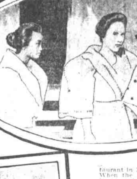
TYPICAL TAGALOG GIRLS.

The underlying principle of Mr. Langley's experiments was that of the wing. He was the first to show that it was possible to build a machine that would fly. He was the first to show that it was possible to build a machine that would fly.