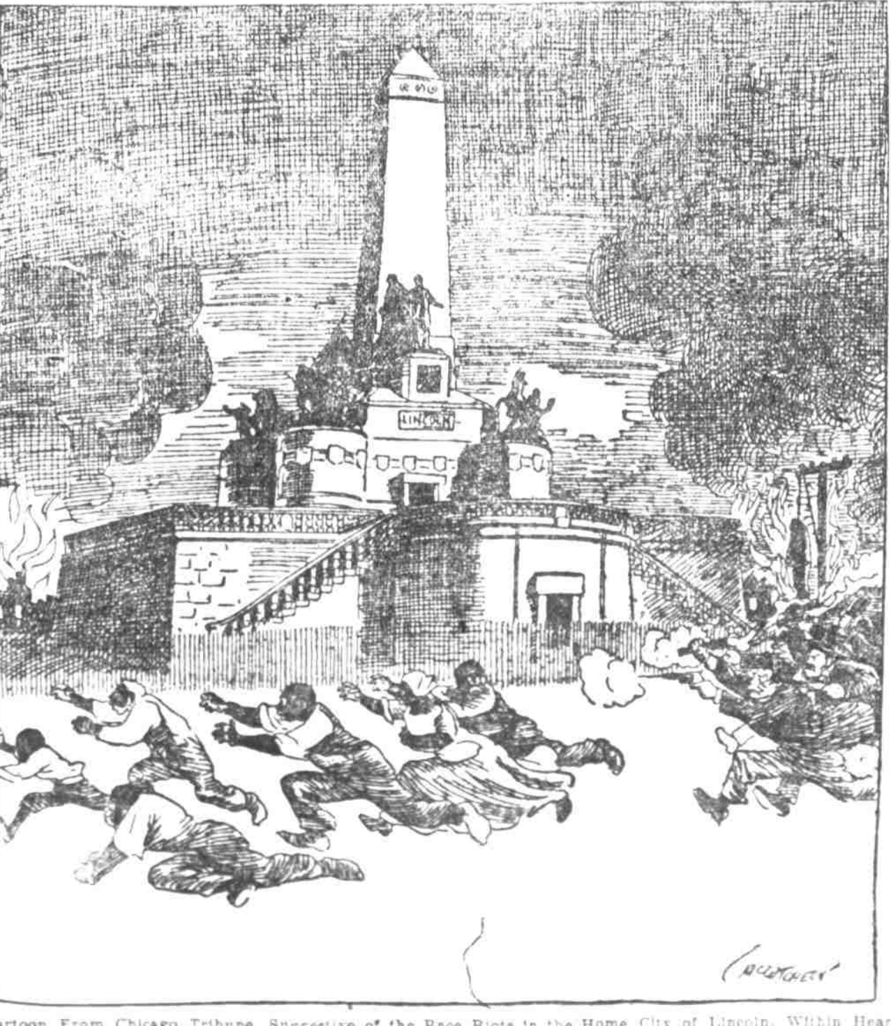
Cartoon From Chicago Tribune, Suggestive of the Race Riots in the Home City of Lincoln, Within Hearing of His Tomb.