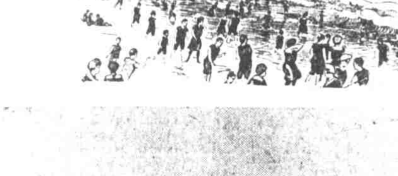
Beach Scene at Long Beach.

S EASIDE, OREGON, Aug. 22.—The weather here today was just what was needed for a pleasant day on the beach. The sun was shining brightly and the breeze was just what was needed to keep the heat from becoming oppressive.