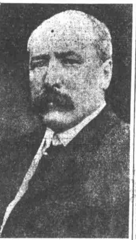
Judge Alton B. Parker, who will speak to Democrats tonight at the Heilig Theatre.

"I don't want to pose as a prophet, but if the Democrats avoid concentrating their efforts on one or two doubtful states and instead devote themselves to carrying Oregon and Dakota and California and as many other states as they can, the chances are very good for Bryan's election. People are anxious for a change. The panic has made many converts to Democratic ranks. There are many unusual conditions facing the leaders. These all make the outlook for a Democratic victory at least promising."