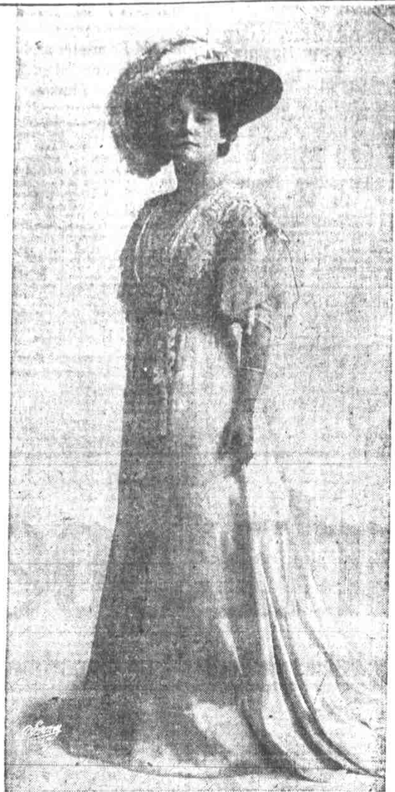
Charming American Actress, Who is Playing in "The Thief" at the Hellig Theatre. In Private Life Miss Illington is the Wife of Daniel Frohman, One of This Country's Producing Managers.