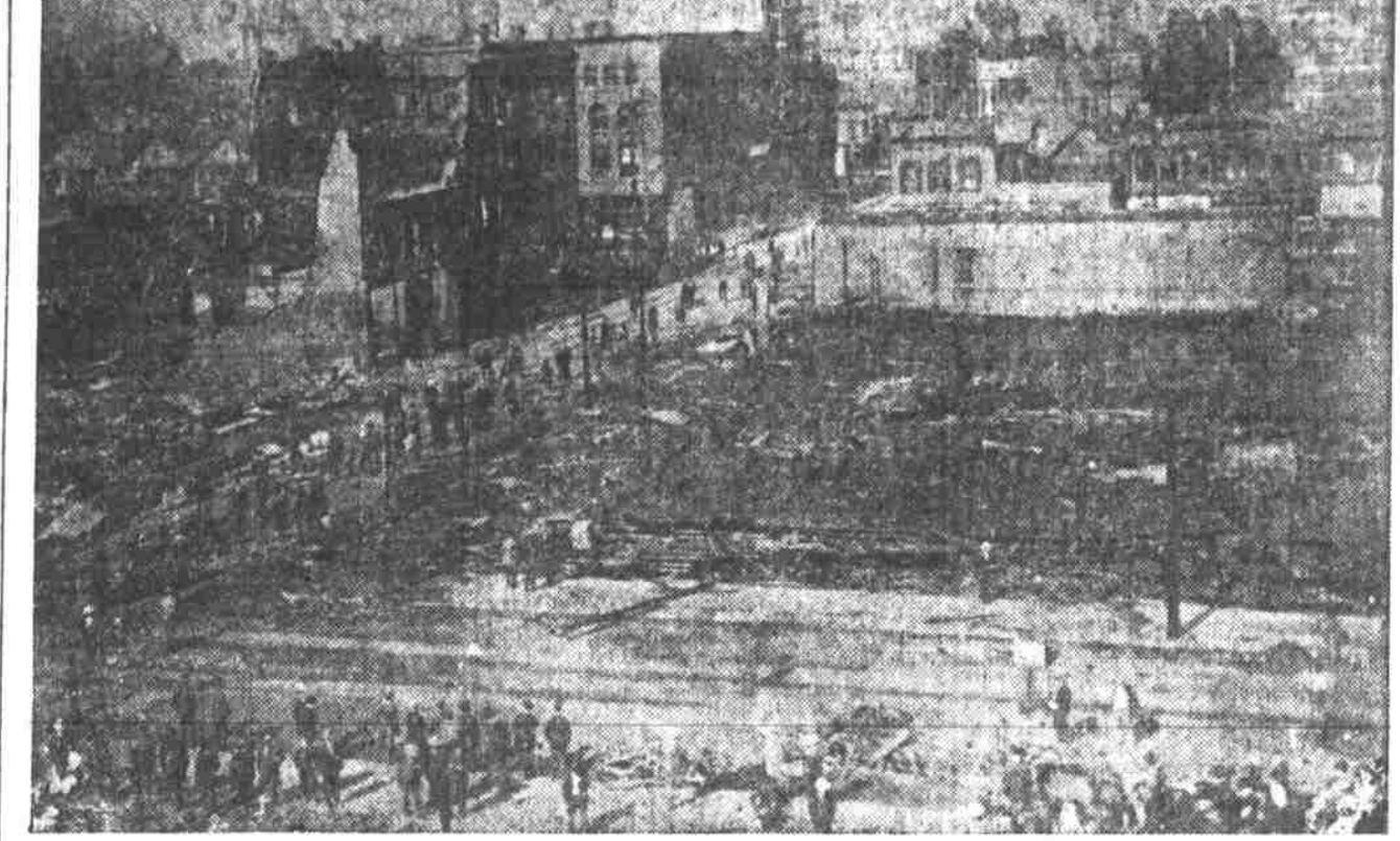
View Taken From Union Meat Company, Showing Portion of Burned District Between Gilsan and Hoyt, Fifth and Sixth Streets. The North and West Walls of the Barr Hotel Are Seen in Left Background.

"To the United East Side Push Clubs.—Gentlemen—Since organization I have been your president and have tried to do everything in my power to carry out the objects and purposes which brought us together. In this endeavor I have been assisted by every delegate to the United East Side clubs, for which I desire to express my sincere appreciation.