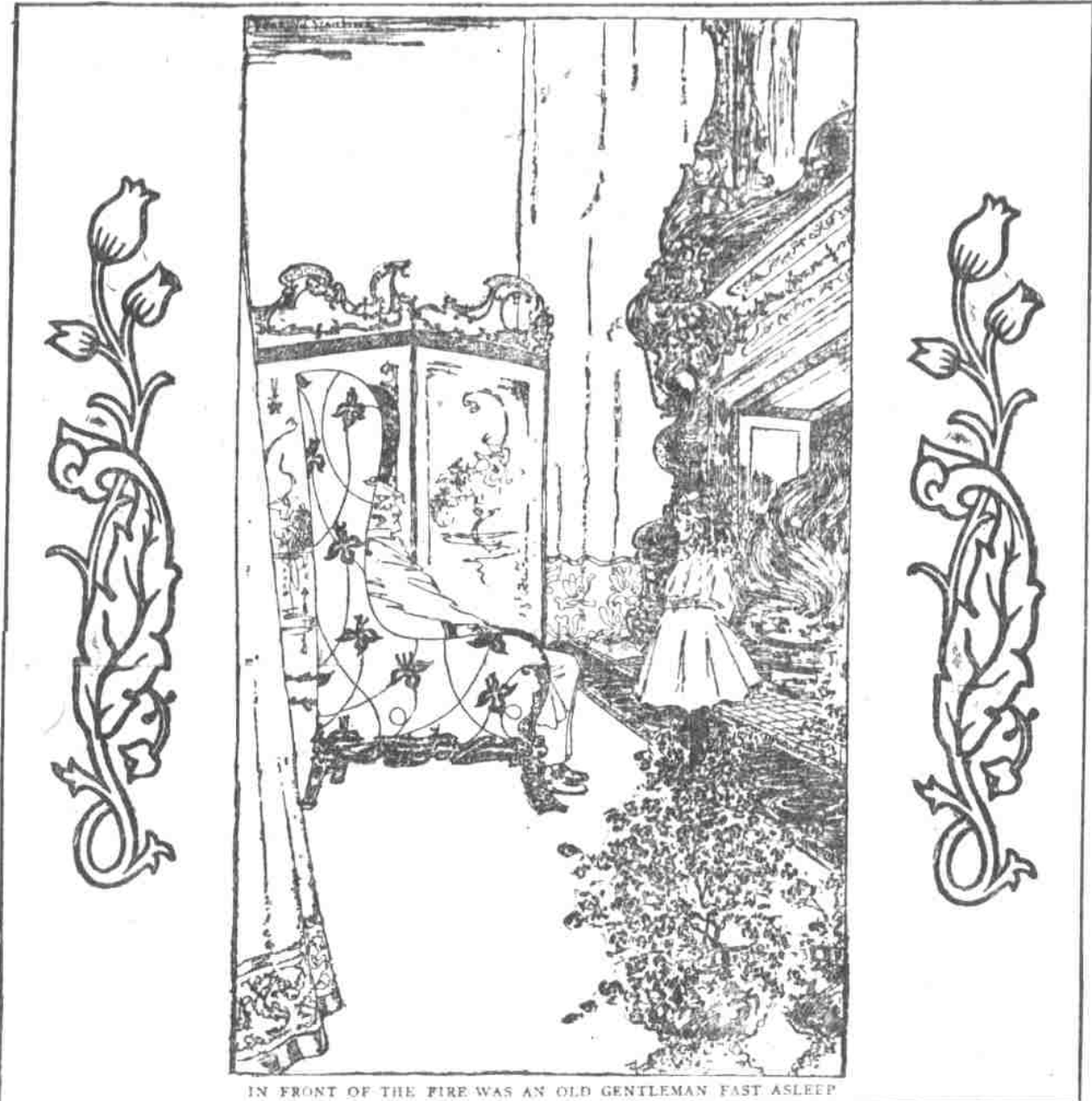
IN FRONT OF THE FIRE WAS AN OLD GENTLEMAN FAST ASLEEP